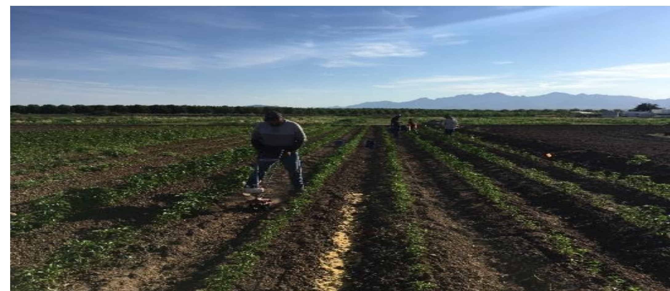
Mustard seed meal application