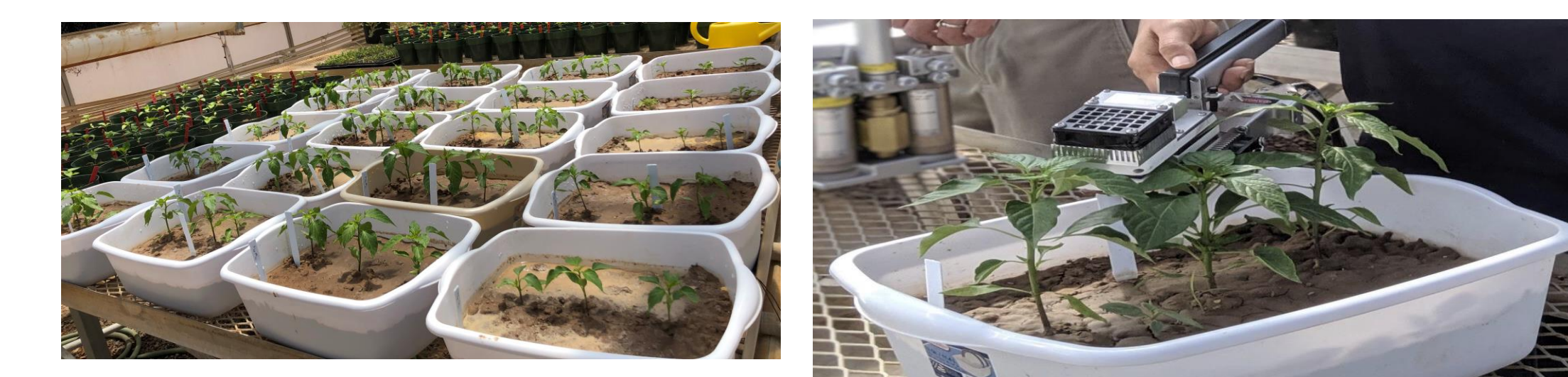
Figure1: Experimental set up in greenhouse