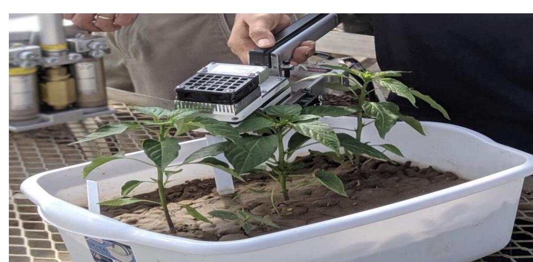
Figure 2: Photosynthetic rate measurement through Llcor