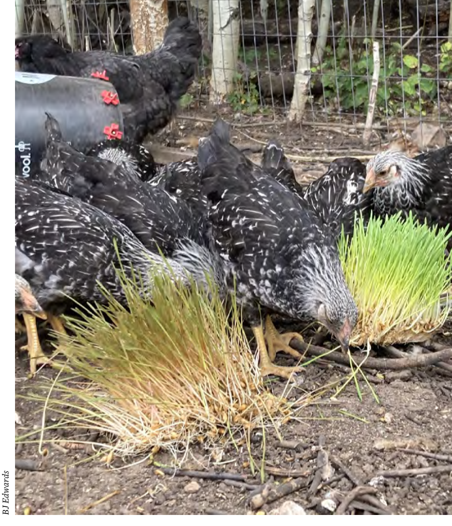
Using spelt as chicken fodder.

Emmer and spelt have potential as forage and fodder crops. They were both panted as forage crops in July of 2021 in a non-replicated trial at two locations in Washakie County and compared to Everleaf<sup>®</sup> forage oats and Stockford hay barley. Emmer demonstrated very rapid early growth compared to the other cool season grains. Spelt has a more prostrate early growth pattern than emmer (similar to wheat) and was a little bit slower to get started. Unlike emmer, spelt does not have awns. This was not a replicated trial. However, it is worth noting that the emmer and spelt trended higher in zinc and iron and