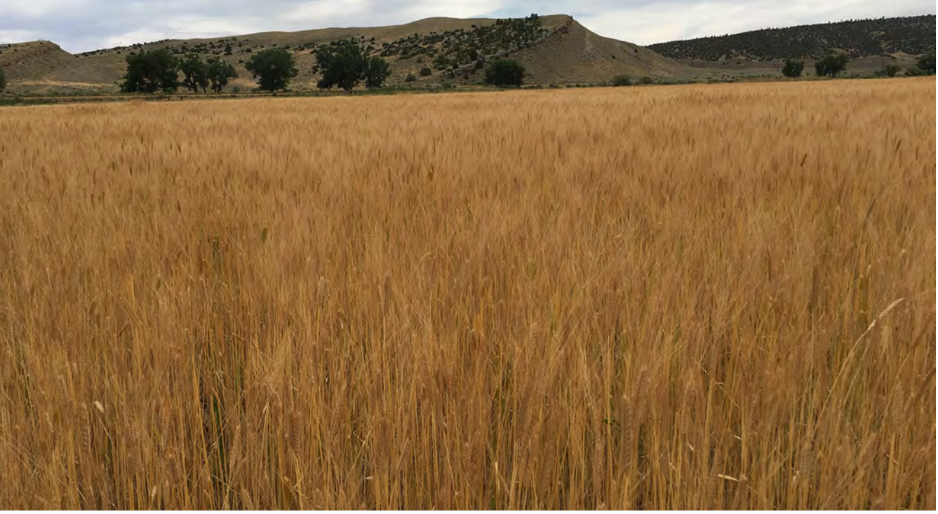
Einkorn field, Hot Springs County, Wyoming.