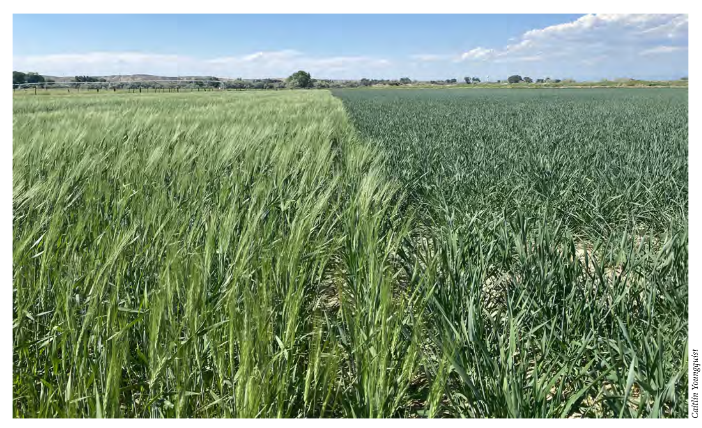
Test plots of emmer (L) and spelt (R), Washakie County, Wyoming.

Emmer ( Triticum dicoccoides ) and barley eventually replaced einkorn as the dominant cereal grains near the end of the Bronze Age. The addition of another genome gave it four sets of chromosomes (tetraploid) and allowed it to thrive in a wider range of conditions than einkorn. It was more widely used than einkorn but was eventually replaced by the hulless wheats. Similar to einkorn, emmer tends to outperform modern wheat under marginal