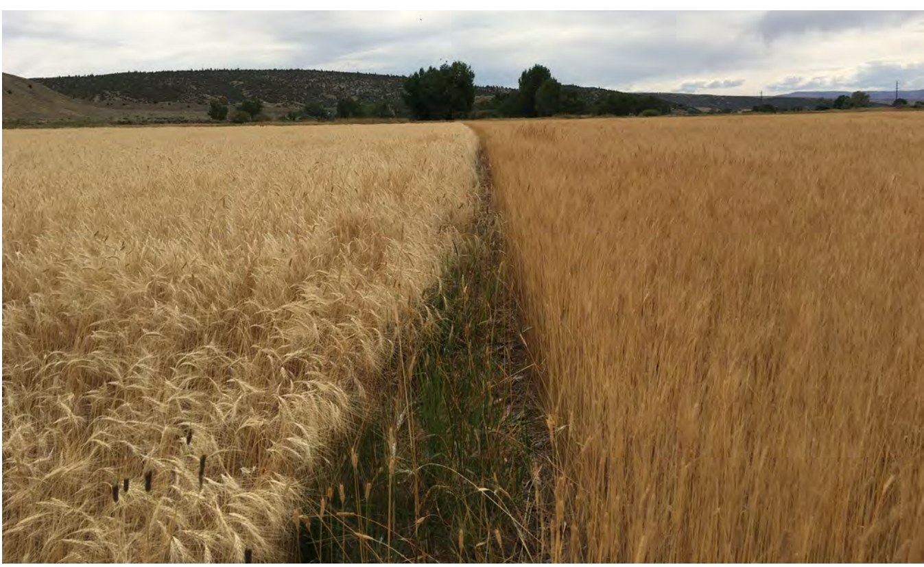
Emmer (L) and einkorn (R) test plots, Hot Springs County, Wyoming.

about Buffum's work claims that "improved winter Emmer...is surpassing even the best wheat as a food for civilized man."