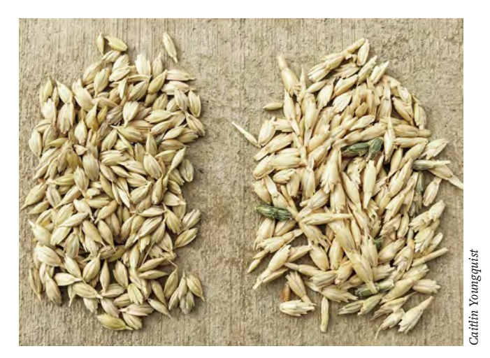
Emmer (L) and spelt (R)

before use as food. A comprehensive comparison of ancient hulled wheats with modern free threshing wheat found an average kernel yield (by weight) of 70% for spelt and emmer, and 58% for einkorn (Longin, et al., 2015). University of Wyoming trials in 2019 and 2020 found an average kernel yield of 61% for einkorn and spelt, and 71% for emmer (Table 2).