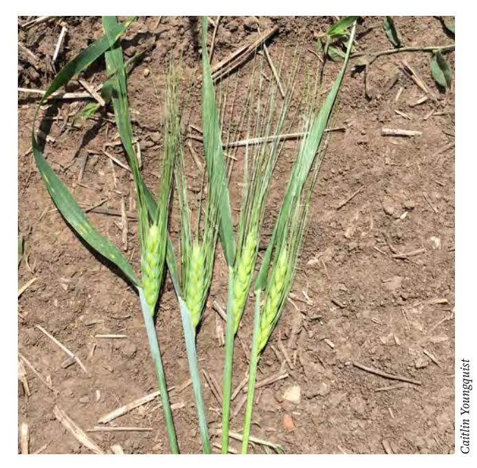
Durum (L) and emmer (R)

It is important to distinguish between the grains referred to as "ancient" wheat in this bulletin and