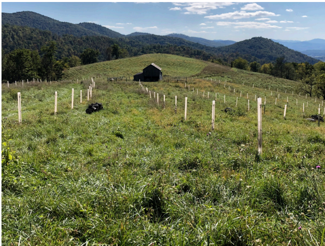
Once mature, the chestnut plantation will help conserve the soil on the ridgetop while diversifying the products offered at Tonoloway.

They started making hickory syrup, “you harvest the bark of the shag bark, which peels away naturally anyway, so it’s not harmful to the tree. We clean it and roast it till it turns smoky, and then grind it ... and make tea from it. It’s sweetened with organic cane sugar. It’s just another way of, you know, sharing a unique taste of something from the area. But I’m more partial to this stuff that comes right from the tree sap though the walnut syrup especially.”