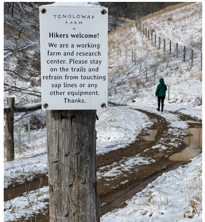
Sign at the entrance of Tonoloway Farm.

of which are black walnut. The farm straddles land that was given to and settled by a group of freed slaves after the Civil War. Christoph plans to donate a piece of roadside land large enough for a historic marker and space for motorists to pull over. The Herbys filled a large part of their open land with a chestnut plantation and planted fruit trees. But they needed some income before these tree crops would bear fruit. Since Highland County is a center for maple syrup production, syrup making made sense as a way to begin their agroforestry operation.