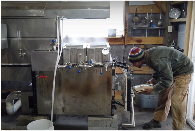
Christoph Herby, fueling the wood-fired evaporator during the 2022 Highland Maple Festival.

walnut trees. “While equal to maple syrup in sugar content black walnut syrup is more complex in flavor and also contains natural pectin that makes the syrup more viscous. One may notice mineral particles forming a pectin like material in the syrup. Many will just shake the bottle to mix these particles back into the syrup. With assistance from Future Generations University, the farm began experimenting with a centrifuge to process out some if not most of the pectin.