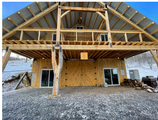
Post and beam sugar house made of locally sourced materials. Downstairs is the sales and storage space, and the evaporator. Upstairs is the office and quarters for a seasonal employee.

Agrotourism is important to Tonoloway. Visitors to the farm will notice a network of sap harvest lines throughout the forest, in addition to pumps and sap collection tanks seen during the harvest season. As the trailhead sign advises, hikers are welcome to explore the trails but need to stay on the trails and refrain from touching sap lines or other equipment. Farm tours may be scheduled by appointment. The festival weekends