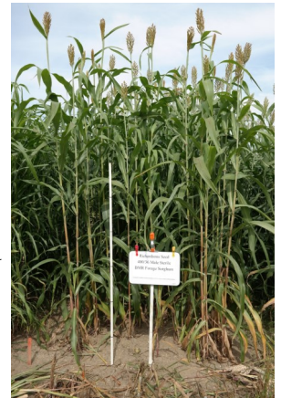
31.6 tons/acre @ 35% DM male sterile sorghum stood without lodging

BMR sorghum sp. has numerous benefits compared to corn. Corn seed is increasingly expensive to grow. Sorghum is $100/acre cheaper to grow for just seed cost. Genetic rootworm resistance in corn is failing, and disease controls require expensive fungicides. Sorghum species eliminates corn rootworm for following corn crops, is not susceptible to corn disease, and is deer-proof. For organic farmers corn silage requires multiple cultivations which leave the soil vulnerable to erosion. Cultivation, critical for the crop success, is at the same time that organic haylage needs to be made. Thus, the haylage is often late, severely limiting the profit potential of the organic farm. Optimum sorghum planting is in drilled narrow rows (replicated research found an 18% higher yield compared 30-inch row) quickly canopies to prevent erosion, shade out weeds, and maximize sunlight interception in short seasons. Based on our work, sorghum-Sudan's rapid emergence and dense stands utilizing a stale seedbed is replacing corn silage on organic farms without cultivation to control weeds. Thus, more organic farms are switching to BMR sorghum-Sudan as their energy forage.