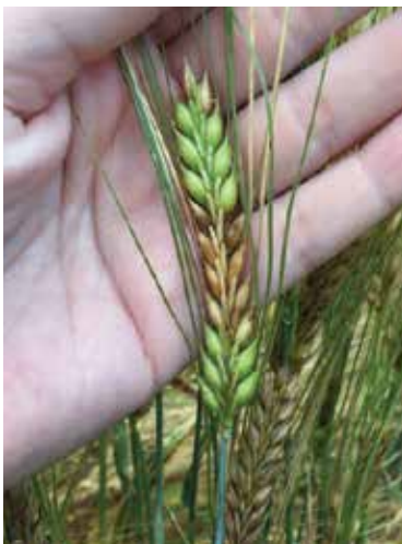
Figure 5. Advanced symptoms of Fusarium head blight on barley with salmon and white fuzzy growth on grain.