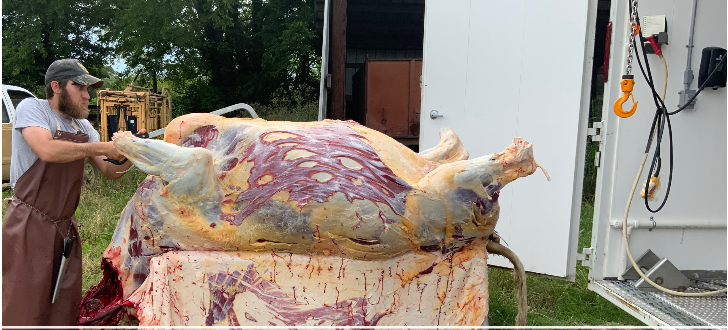
Skinning and Splitting the Breastbone