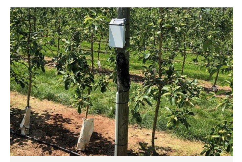
Irrigation set-up.

Working with growers to effectively implement a precision irrigation system is the major focus of these projects. In 2019, the focus is on monitoring soil moisture levels using preexisting irrigation plans. At the end of the 2019 season, a comprehensive evaluation will be conducted to assess how soil water levels fluctuated over the season and the effectiveness of the