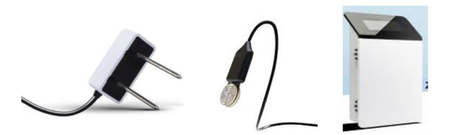
Figure 1. Equipment used in the test. The TEROS 10 soil water content sensor (left), the TEROS 21 soil water potential sensor (middle), and the ZL6 datalogger (right).

In our experimental design, three sensors are used to monitor soil water content in the root zone at one, two, and three-foot depths, and the water potential sensor is used as a reference to compare the two types of sensors. The sensors are connected to a datalogger, that monitors the output from the sensors regularly, for example, at ten-minute intervals.