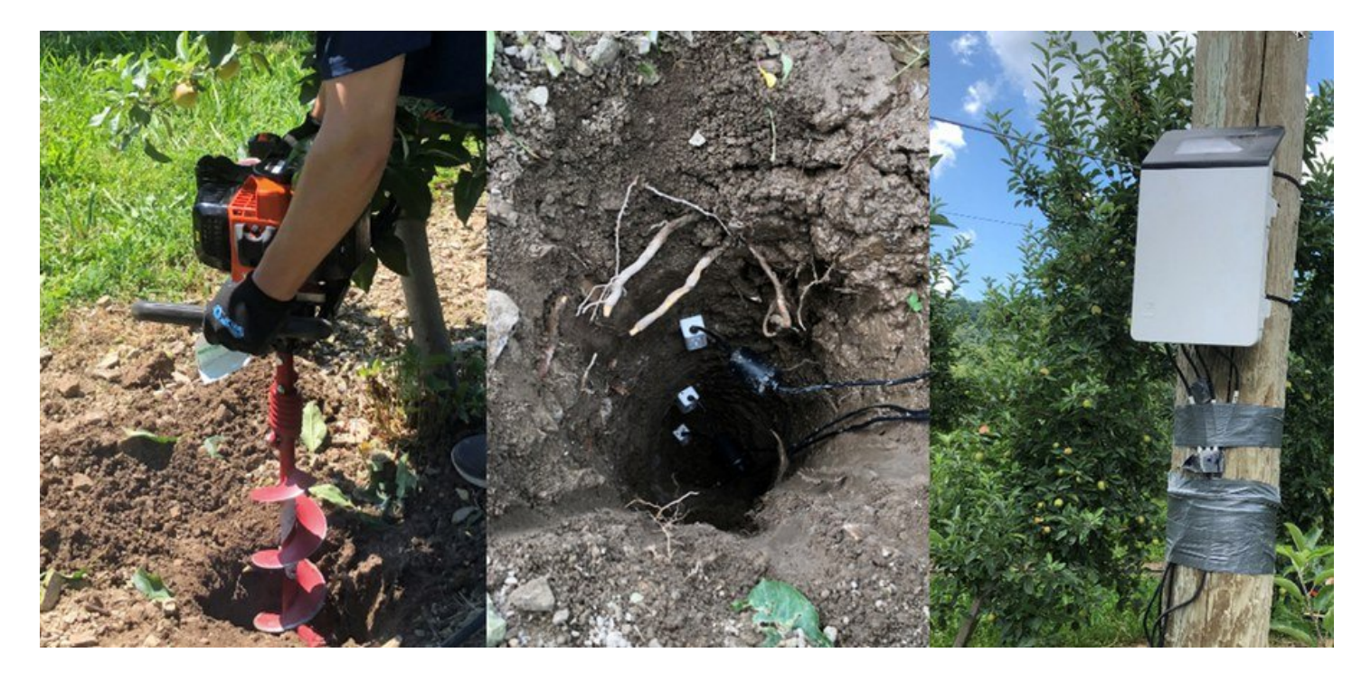
Figure 2. Sensor installation. Dig or drill a three-foot deep hole (left). Install the sensors (middle). Mount the ZL6 datalogger on a post and connect the sensor cables to the datalogger (right).