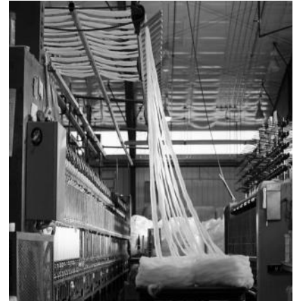
MMW Spinning Frame

eco-friendly and natural. Greener practices have helped create luxurious yarns that are soft and have a more natural connection to the land. Mountain Meadow Wool has continued to expand their yarn lines and explore new and exciting innovations in wool fiber.