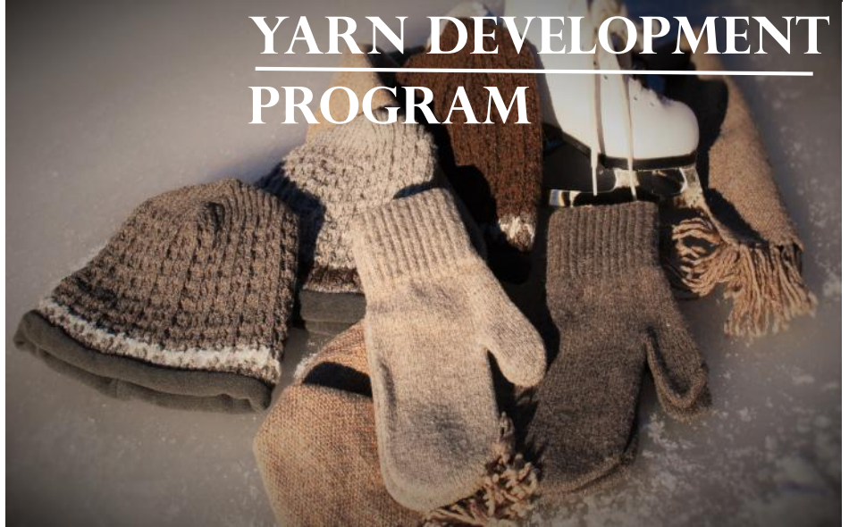
MMW Finished Products

eco-friendly and natural. Greener practices have helped create luxurious yarns that are soft and have a more natural connection to the land. Mountain Meadow Wool has continued to expand their yarn lines and explore new and exciting innovations in wool fiber.