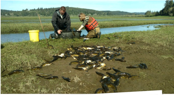
(left) Coos SWCD staff volunteering with Oregon Department of Fish and Wildlife to assist with sampling for juvenile Coho in Winter Lake and Beaver Slough in Spring 2016.