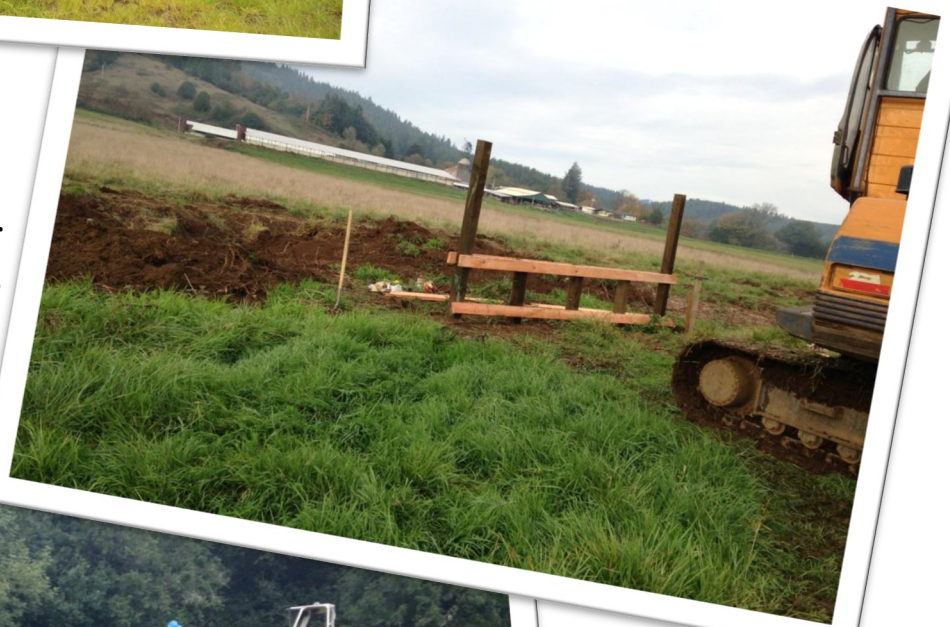
Project Implementation: construction of 'elk-braces' for wildlife stream crossings, Fall, 2016