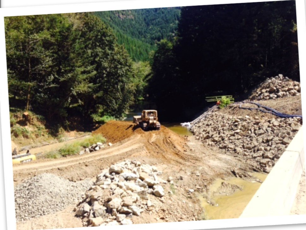
(above, left) Coos SWCD staff assisting Coos Watershed Association with fish salvage at the Millicoma Oxbow Reconnection Project, Summer 2016.