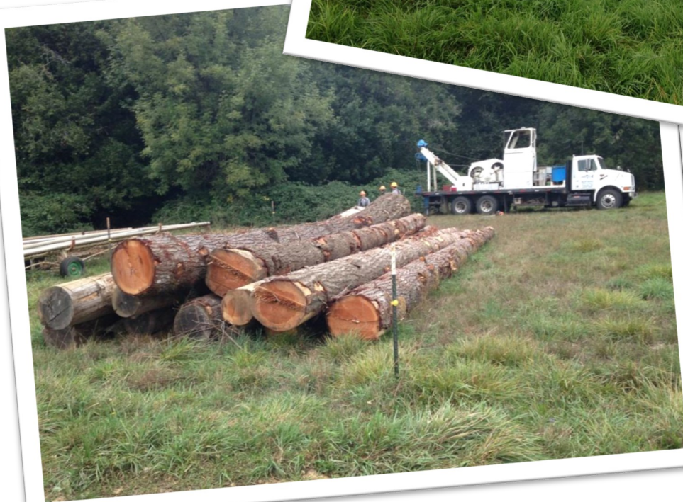
Project Implementation: logs piled and ready for instream placement, Fall 2015