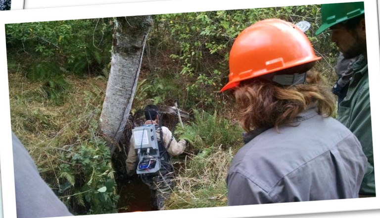
(above, left) Coos SWCD staff partnering up with & educating Northwest Youth Corp in Fall 2016.