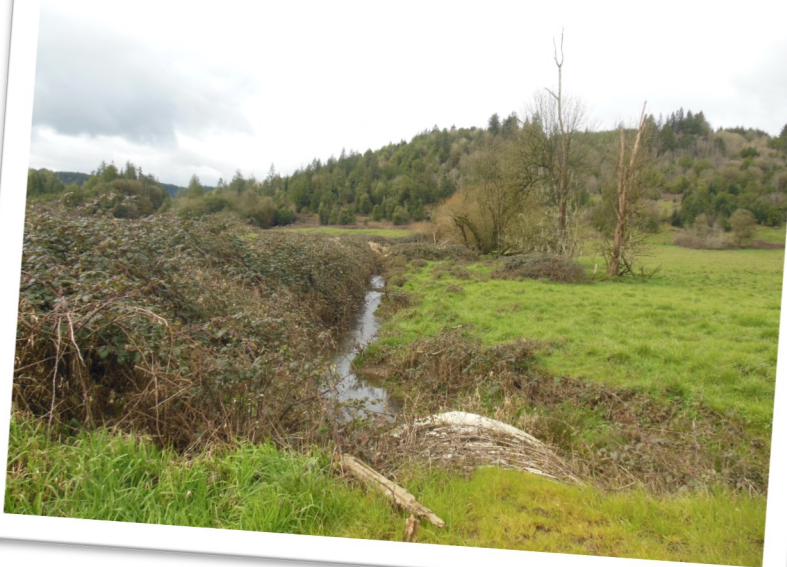
Wood Creek Pre-Project: degraded riparian, lots of blackberry, Summer, 2015