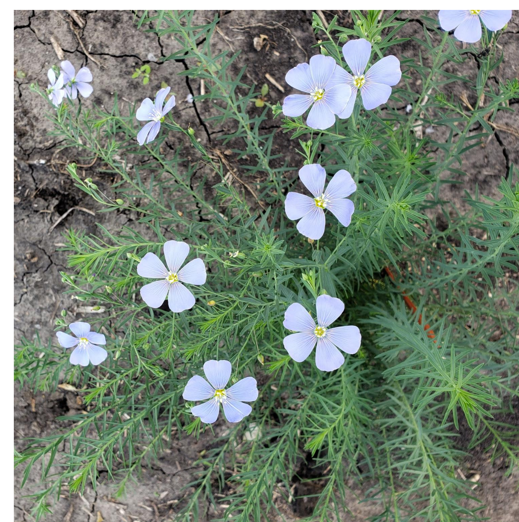
Figure 2. Mature flax blooming in late summer.