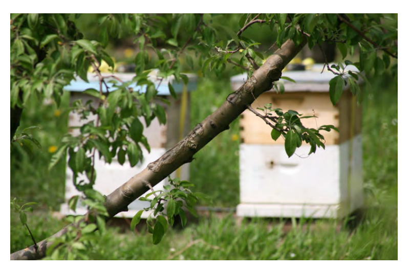
During Year One, hives were placed among the apple trees for pollination. We suggest that the stress of moving hives into the orchards for pollination contributes to weakened populations.