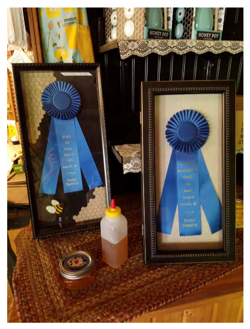
A marker of success, the honey from Curtis Orchard and Pumpkin Patch was judged "World Grand Prize Winner" is 2016.