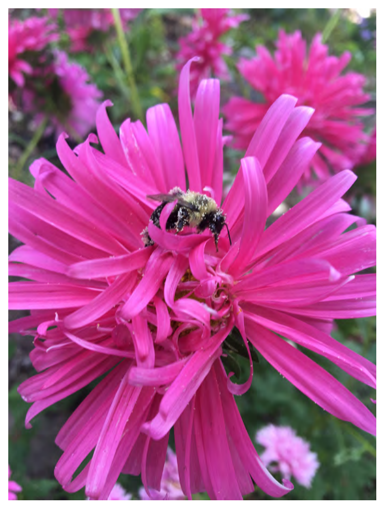
Pollen grains cover this bumble bee. Planting wildflowers attracts wild pollinators as well as honey bees, promoting pollination on small farms.

turned into honey or pollen to be turned into baby food for bees, and the flower begins the process of making seeds and bearing well-formed, marketable fruit.