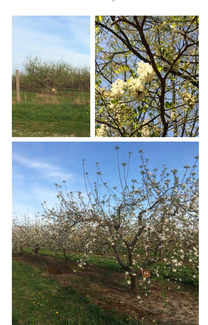
Views of Curtis Orchards during apple bloom.