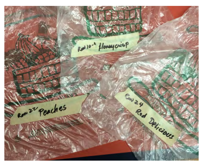
Pollen grains can vary widely among different varieties of apples. When collecting pollen to view under the microscope, it is important to label each type of pollen and keep it separate from the pollen from other plants. These baggies will be used to collect blooms from different parts of the Curtis Apple Orchard.