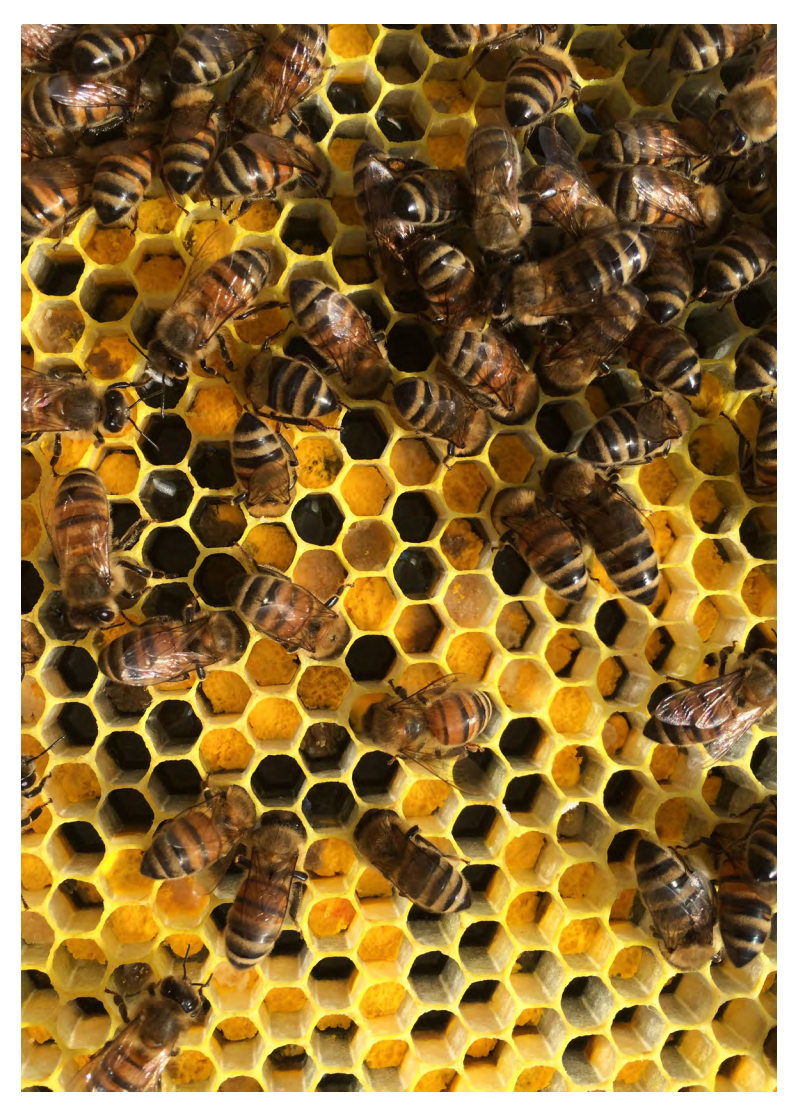
This multicolor frame is packed with pollen gleaned from many different crops. Frames of pollen in the hive are often located near the nursery. The future health of baby bees depends on a diverse, high quality diet of pollen and honey, typically available on a small farm.