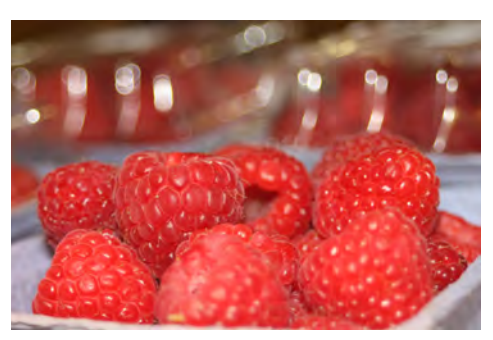
Diversity on a small apple farm usually includes other fruit.

At the start of the SARE grant, the farm's two apiaries were located close to the apple orchards. Out of ten hives in the main apiary, two were mature hives older than one year, while eight others were new, recently installed from three pound packages of bees. A second, smaller apiary had only two hives, one new and one mature.