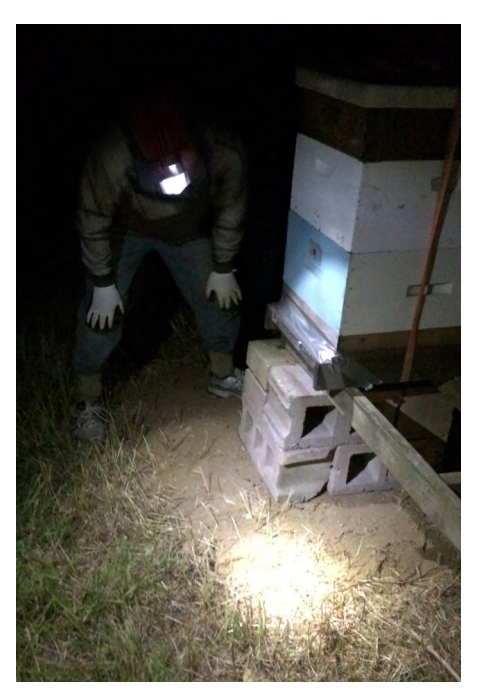
Migratory beekeepers move hives long distances to pollinate crops. Since honey bees return to the hive for the evening after working in the fields, hives are often moved at night.