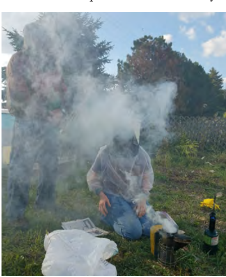
Beekeepers use smoke to calm bees. When beekeepers inadvertently smoke themselves, they try to stay calm.

POLLINATION from a stationary apiary, where hives remain in one spot on the farm for the entire season, was a standard feature of many farms in the 1950s and 1960s. Back then, farms offered a diversity of crops that would sustain honey bees throughout the summer season. In the last decades of the twentieth century monocultural agriculture became dominant and stationary beekeeping for pollination was gradually supplanted by migratory beekeeping. In monoculture, there is little sustenance for bees after the bloom of a single crop, so honey bee colonies must be moved from one crop to another. For example, over 31 billion honey bees are likely to converge on the Central Valley of California for a few weeks in February to pollinate the almond orchards. When the pollination period ends, the bees are usually transported to another crop. Unlike monocultural farms, small farms offer more diversity throughout the growing season, providing a foundation for alternative pollination techniques such as stationary apiaries.