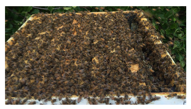
We evaluate a strong hive for pollination by the number of frames covered by bees. We expect to see at least six frames of bees when the cover is removed. This is a very strong hive.