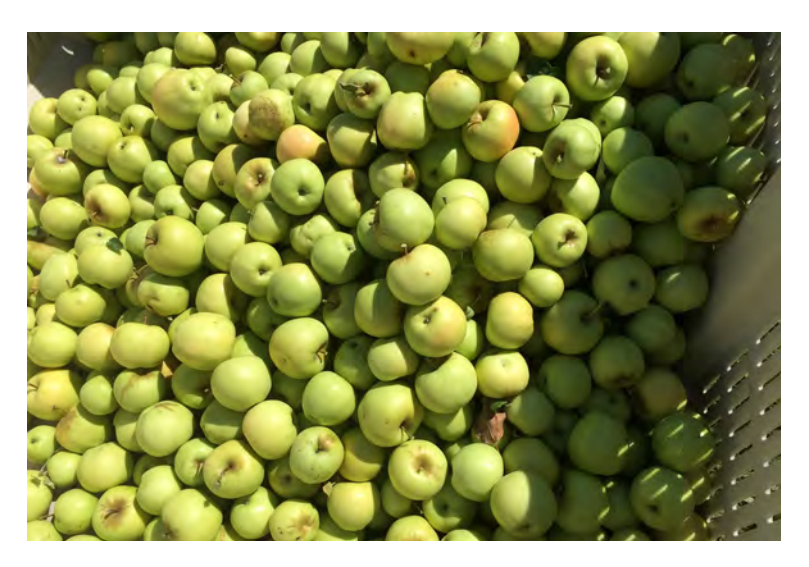
Successful apple pollination rewards the farmer with plentiful well-formed fruit and early set.

During the second year, we observed an increase in honey bees when we went bee spotting among the apple blossoms. Besides spotting more honey bees on the apples, we noted the presence of native bees. Meanwhile the cherry trees nearby continued to hum with pollination activity.