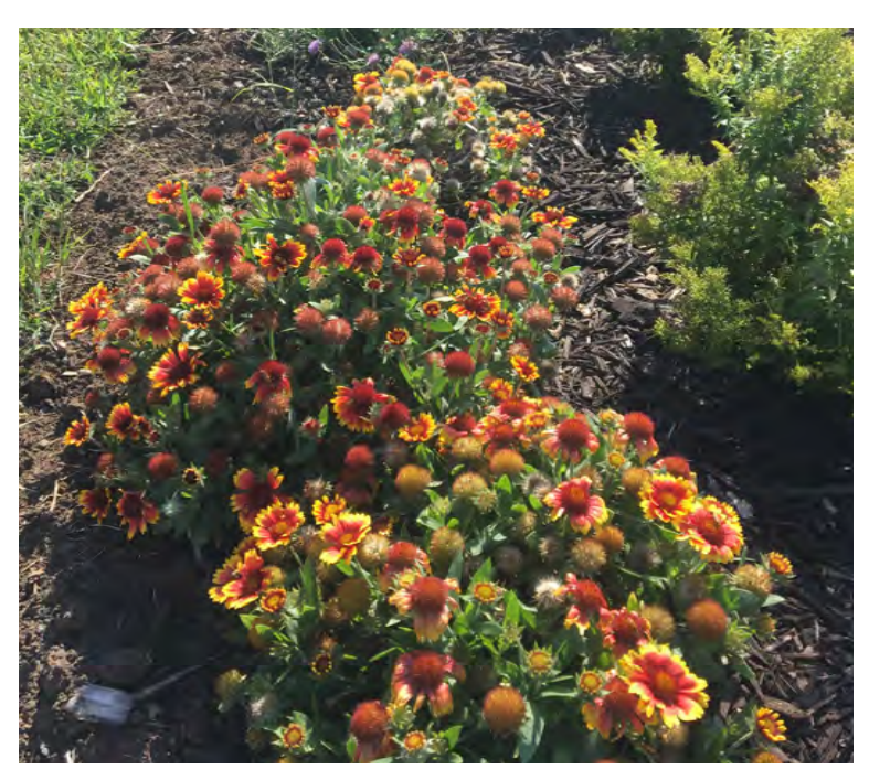
Flower beds are placed strategically around Curtis Orchard to attract pollinators.

We also decided to allow dandelions and other wildflowers to flourish in the orchard instead of mowing them down. Based on other SARE research and a helpful webinar, we learned that wildflowers growing near crops were likely to attract native pollinators who might assist our honey bees in pollinating apples and other crops. We reasoned that pumpkins, not a honey bee favorite, would also benefit from additional native pollinators.