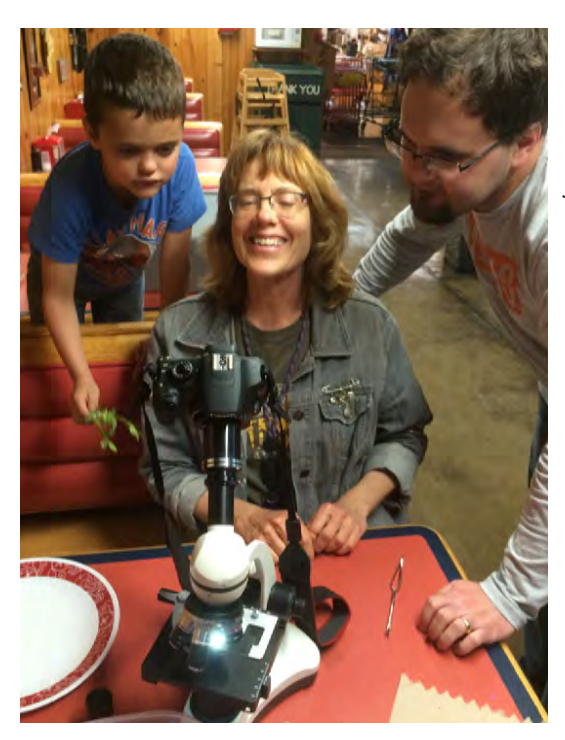
We used a compound microscope to examine samples of pollen taken from the orchard.