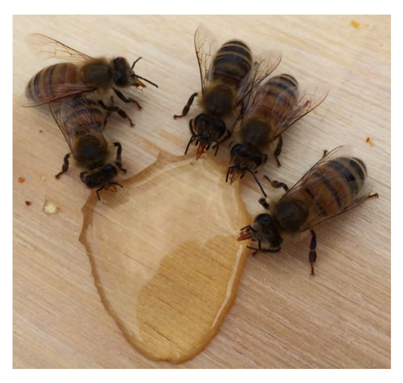
Bees make honey to eat when flowers are scarce. It is their staple food to get through the winter. Here you can clearly see their tongues, which roll like straws to suck honey.