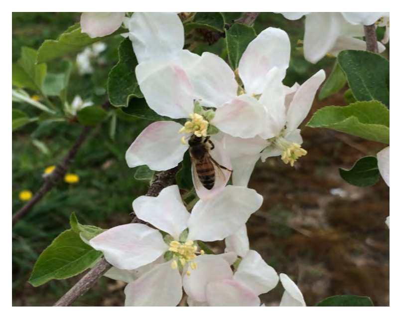
Bee spotting helps evaluate the attractiveness of your crop. To spot bees, get close to the blossoms, stand still, watch and listen. Count the number of bees you spy in a three minute interval. Don't forget to count native bees and other pollinators, too.

When we checked out our pollination strategy with apple pollination experts, we realized that the number of hives we were using, 12 hives on 18 acres, did not meet the recommended minimum ratio for pollinating apples, one hive per acre. Additionally, the hives should be strong. Most of the hives that we used for pollination during the first year of the grant were weak first-year hives.