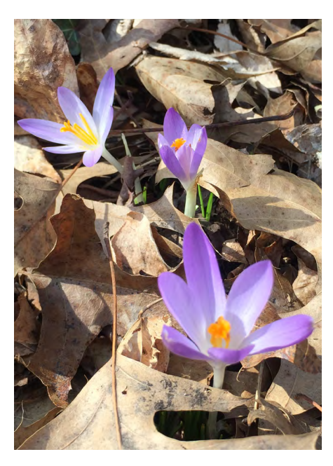
Mowing competing blossoms is a common pollination practice. We questioned its usefulness.

Right from the start, we noticed that many bees strayed from the task of pollinating the apples. When we went bee spotting among the apple blossoms, we located only one or two bees in a five minute period. On the other hand, the nearby cherry trees practically hummed with bees.