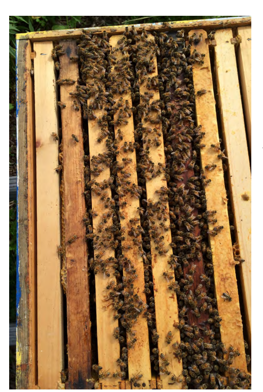
We consider this hive weak for pollination since it covers only four frames.