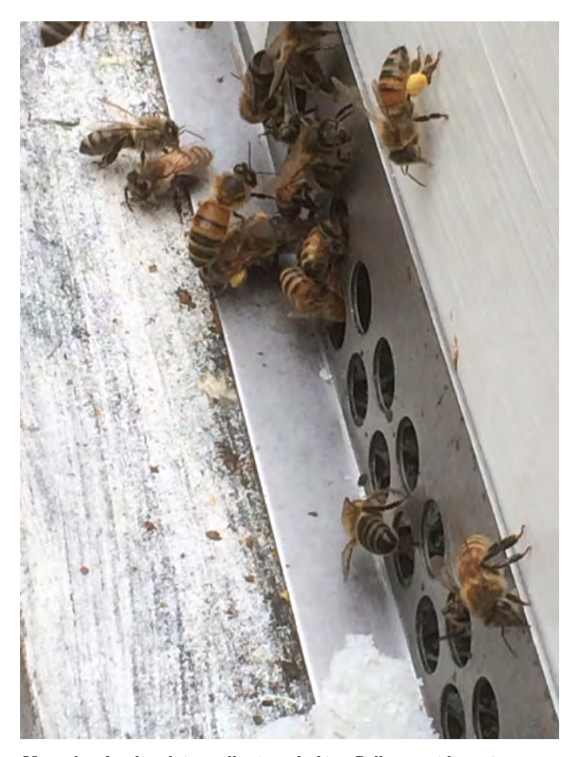
Honey bees hustle to bring pollen into the hive. Pollen provides an important source of protein for young larvae. These bees have found a source of pollen in early spring. Note the snow on the bottom corner of the winter mouseguard.