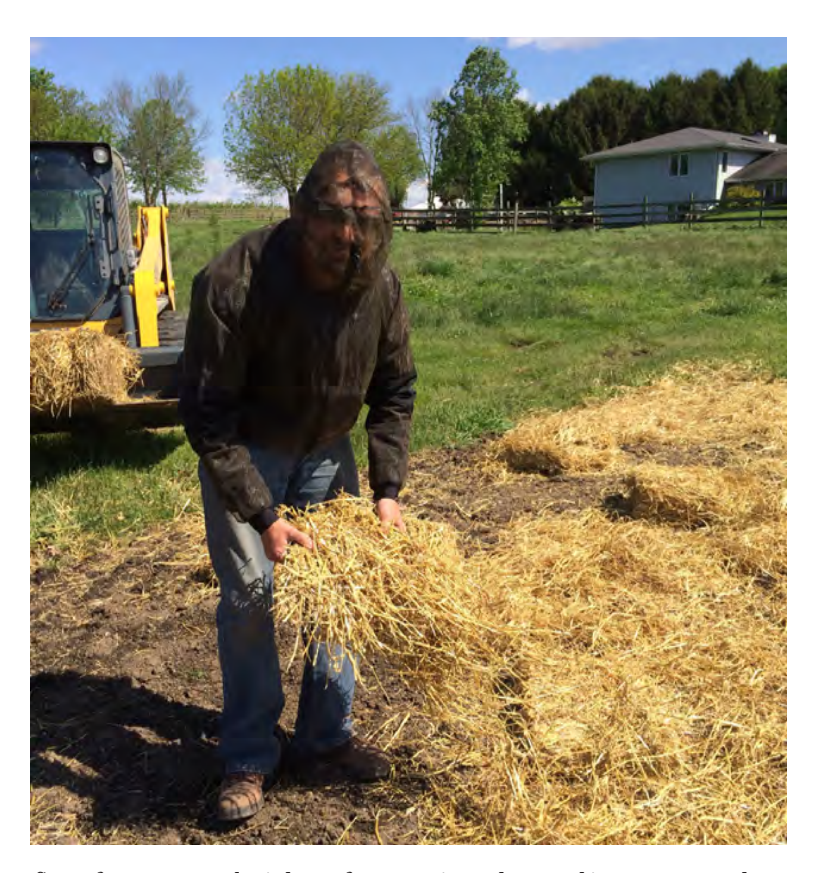
Some farm personnel might prefer protection when working near crops that attract bees. It is always a good idea to have a spare veil on hand.