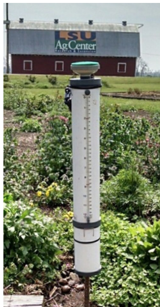
Figure 2. Example of an atmometer.

The atmometer is a water-filled tube measuring 3-4 inches in diameter and 12 inches tall (Fig. 2). The top of the tube is covered in a green fabric that simulates ET_o from a reference plant leaf. A clear tube with inverted markings indicate the water level within the opaque main tube. The water level aligns with zero when the tube is full. As the water level drops due to evaporation through the green fabric, a cumulative estimate of water loss is visualized using the depth markings. A movable red ring around the small, clear tube can be used as a trigger threshold for irrigation.