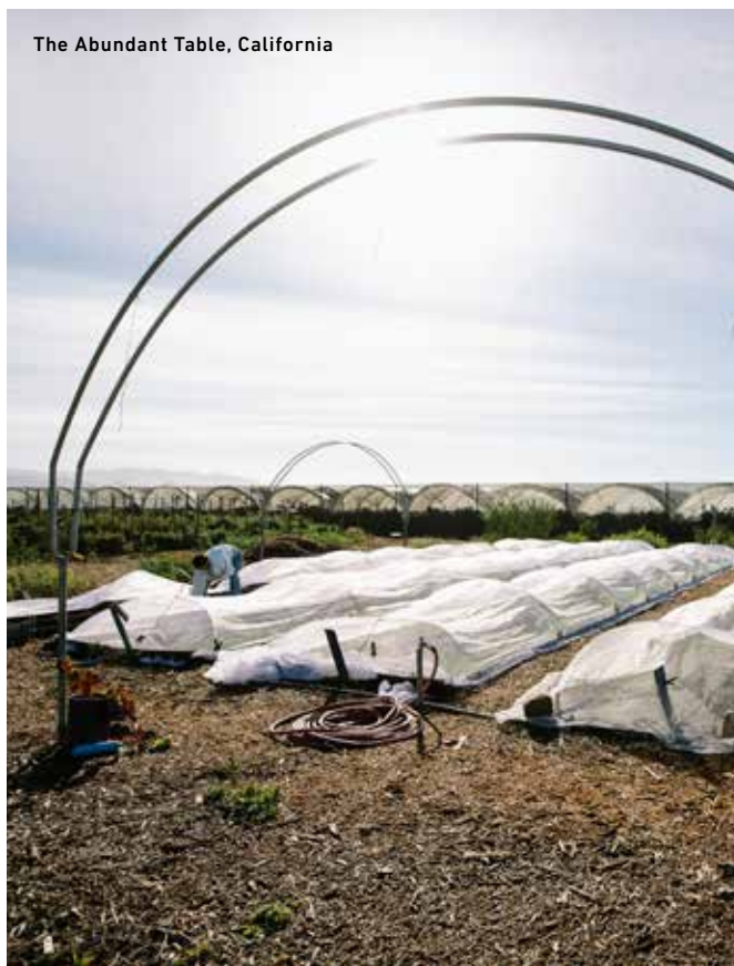
The Abundant Table, California