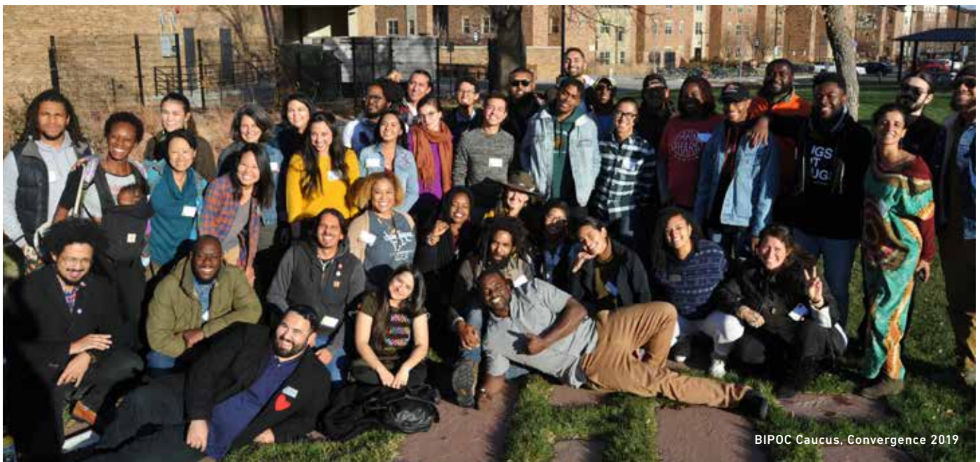
BIPOC Caucus, Convergence 2019

People are born into various forms of structural privilege and oppression. Learning about racism, heteropatriarchy, intersectionality, and other systems of power is the first step toward reckoning with inequity in our society, and responding with action. Identifying the ways in which we ourselves have been marginalized—how these experiences dovetail with our privilege—can serve as an access point to understanding forms of oppression that we may not experience ourselves. That being said, the concept of intersectionality should not be used to minimize the impact of racism on people of color. It is important to recognize that racism is the most powerful form of oppression in our country.