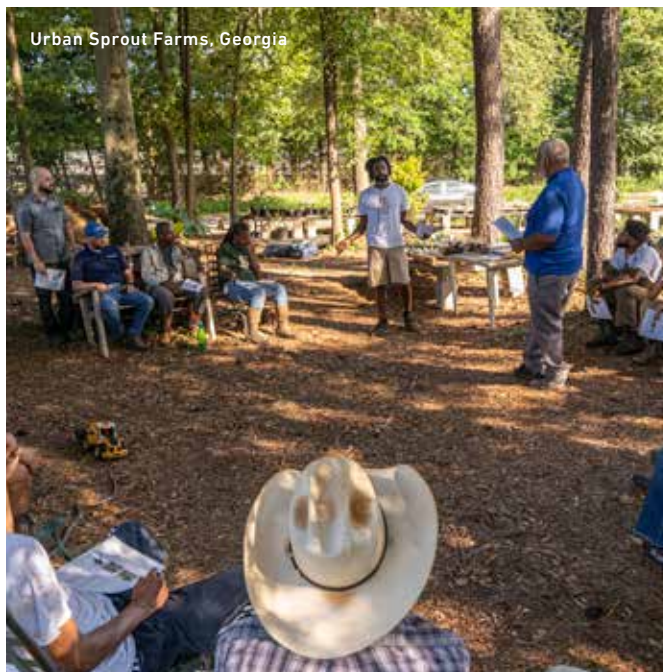
Urban Sprout Farms, Georgia

The legal and social constructs of race in the U.S.—and the very idea of “Blackness” and “whiteness”—were created early in the history of this nation by wealthy landowners who understood that an alliance of European and African-descended slaves and indentured servants posed a major threat to their power and wealth. Race and the idea of white supremacy served to prevent natural alliances between Black and white working class people, and protected the ruling class and the prevailing economic system. Understanding this history helps us understand that racism and oppression affects all of us, not only people of color. Because racism and white supremacy undermines our relationships and coalition building, it is destructive to our society, our economy, and our movement.