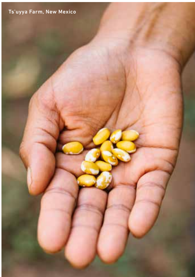
Ts'uuya Farm, New Mexico

Step 6: Combine with tools for further engagement. Accompany the acknowledgment or blessing with a list of resources for participants to learn more about local Indigenous people and their history, and to take further action to return land and power. One resource you could share to help facilitate this is Soul Fire Farm's Reparations Map for Black-Indigenous Farmers.