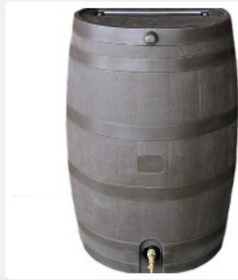
Easy to Use