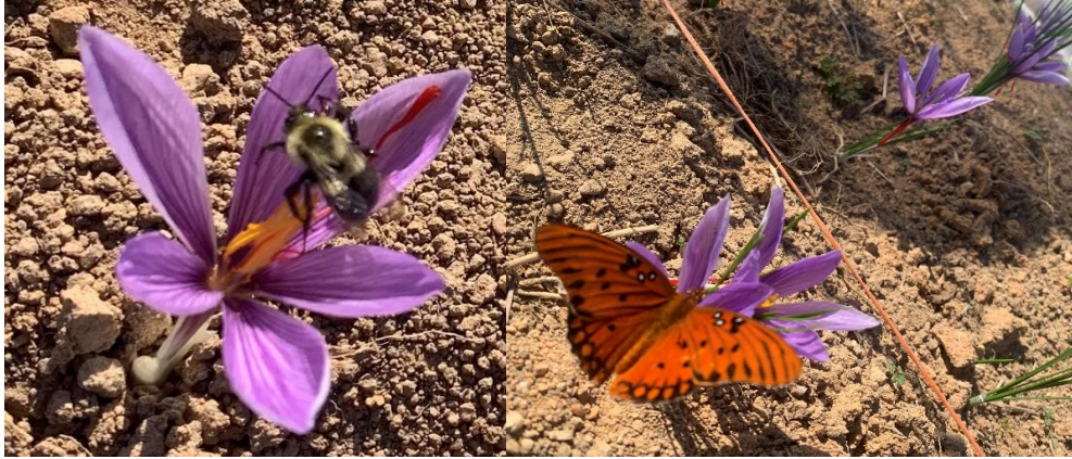
Photo: Biodiversity of pollinators in the experimental plots.