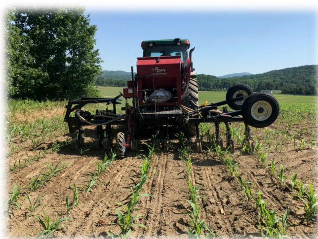
Image 2. Interseeder planting cover crop seed.

Additional research is needed on the corn silage/cover crop system to better evaluate cover crop establishment. With the highly variable results and climate change influencing our cropping systems, it is very important that we can interseed cover crops that are effective and beneficial to the environment and the farm’s viability. The results from this project indicate that weather and cultural practices such as herbicide selection and tillage influence the establishment of cover crops more than what type of ear corn or the seeding population you are planting at. One important outcome from this project is that population rates above 28,000 do not statistically significantly change net revenue per acre. As the costs of seed continue to rise this is an important consideration.