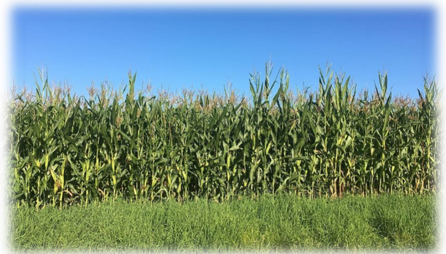
Image 1. Established corn field.