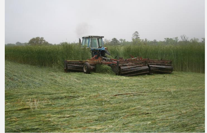
Cereal rye cover crop rolling/crimping in March 2011 at Brock Farm in Monticello, Florida. Custom roller/crimper design and fabrication by Kirk Brock