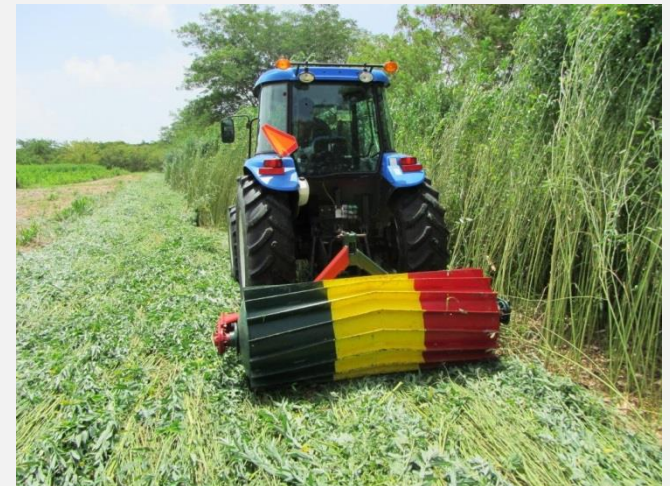
Rolling/crimping of sunn hemp cover crop on St. Croix, USVI. Design by Stuart Weiss