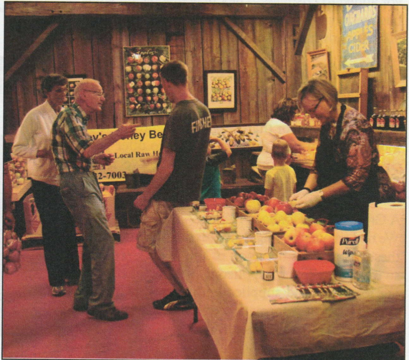
Week 4: A tasting event at Doud Orchards in Denver, IN