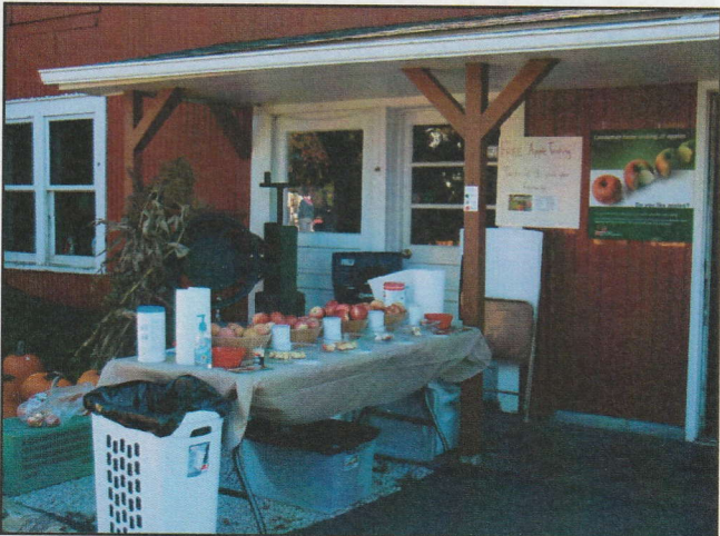
Week 6: Apple tasting setup at Sage's Apples, Chardon, OH