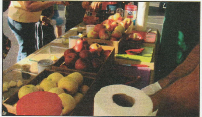
Midweek 3: A colorful row of MAIA apples for tasting