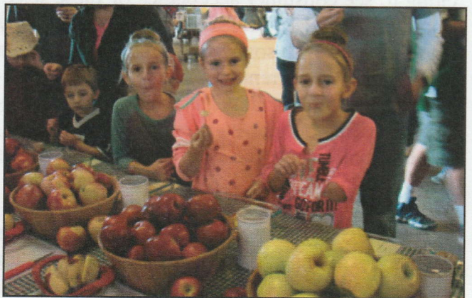
Week 5: Young apple consumers enjoying the taste tests