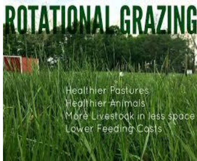
Rotational Grazing Best Practices