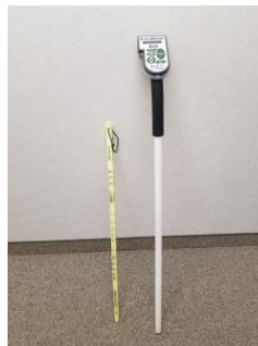
Sward Stick & Capacitance Meter