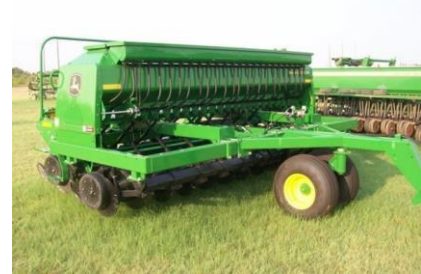
No-till drill for interseeding