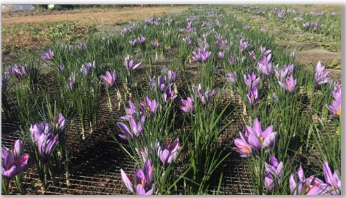
Saffron experimental field in South Kingston. The experimental field was protected against voles by laying down galvanized hardware cloth with half-inch square mesh from September to July. Mesh was big enough for saffron to grow through and small enough to keep voles from feeding on corms. The photo was taken on November 3, 2018 (Left). Saffron experimental field during flowering in October (Right).