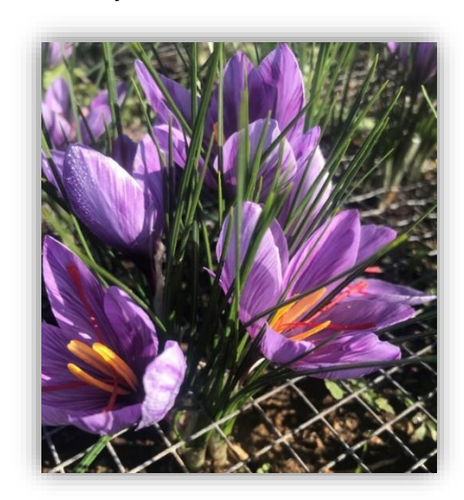
Bunch of Saffron flowers in the second year. The photo was taken on 24 October 2018.

Research conducted at URI assessed the survival and productivity of growing saffron in southern Rhode Island. This research was conducted from September 2017 to December 2019 at URI's Gardner Crops Research Center in Kingston, RI. The first experiment showed that saffron can survive and produce an excellent yield in southern Rhode Island. Research also confirmed that winter protection and a corm density higher than 15 corms/ft² is unnecessary and counterproductive. The optimal frequency of digging and replanting corms has not been identified for saffron production in the northeastern United States, but 11 corms/ft² produces an acceptable yield for three consecutive years.