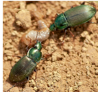
Left: Ground beetle, Agonum cupripenne Right: Two Poecilus lublandus ground beetles feeding on a caterpillar