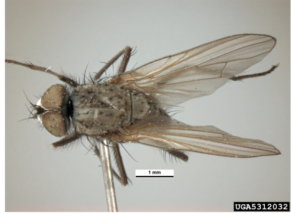
Adult Delia fly. Image Number: 5312054 (left) Image Number: 5312032(right) Photo credit: Pest and Diseases Image Library, Bugwood.org. Creative Commons Attribution-Noncommercial 3.0 License.