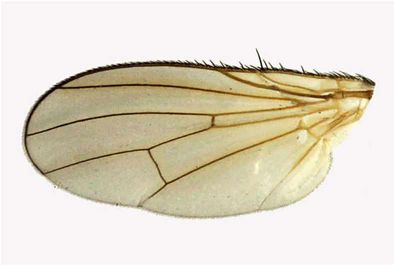
Wing of Delia showing venation and hairs on wing leading edge. Wing length 5.44 mm http://bugguide.net/node/view/877556 . Photo credit: Richard Migneault, Bugwood.org. Creative Commons Attribution-Noncommercial 3.0 License.