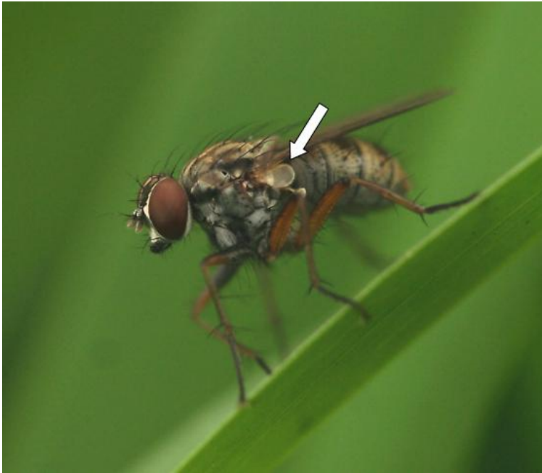
Image of calypter at base of fly wing.

The calypter, a small membranous flap at the base of the hind edge of the wing, is notably larger compared to other flies.