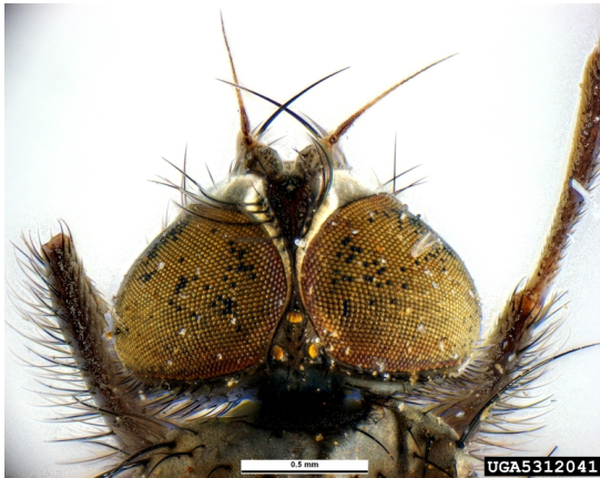
Adult Delia fly head showing distinctive cross hairs (left). Image Number: 5312041.. Photo credit: Pest and Diseases Image Library, Bugwood.org. Creative Commons Attribution-Noncommercial 3.0 License.