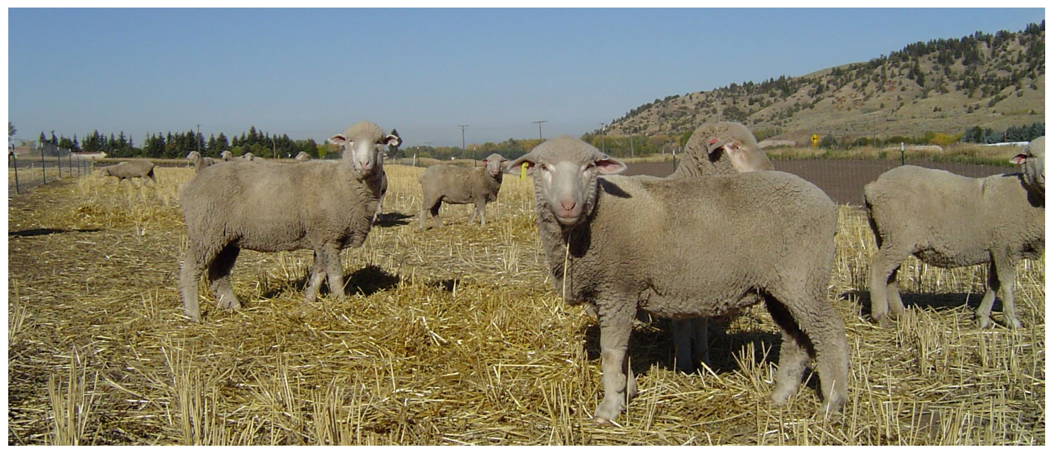
Figure 4. Sheep grazing wheat stubble in Montana, reducing excess crop residue and incorporating organic matter into the soil.

Control of this pest has proven quite difficult. Insecticides have minimal impact because the insect population emerges over a 4- to 6-week period and is difficult to target with a single application. Tillage and burning also have not been very effective. Plant breeders are working on this problem, but the solid-stem varieties of spring and winter wheat developed so far have only variable resistance to the insect. In addition, the yield with the resistant varieties can be lower than susceptible varieties when sawflies are not present. Breeders are developing newer varieties with improved yield, sawfly resistance, and forage value, but so far results are inconsistent.