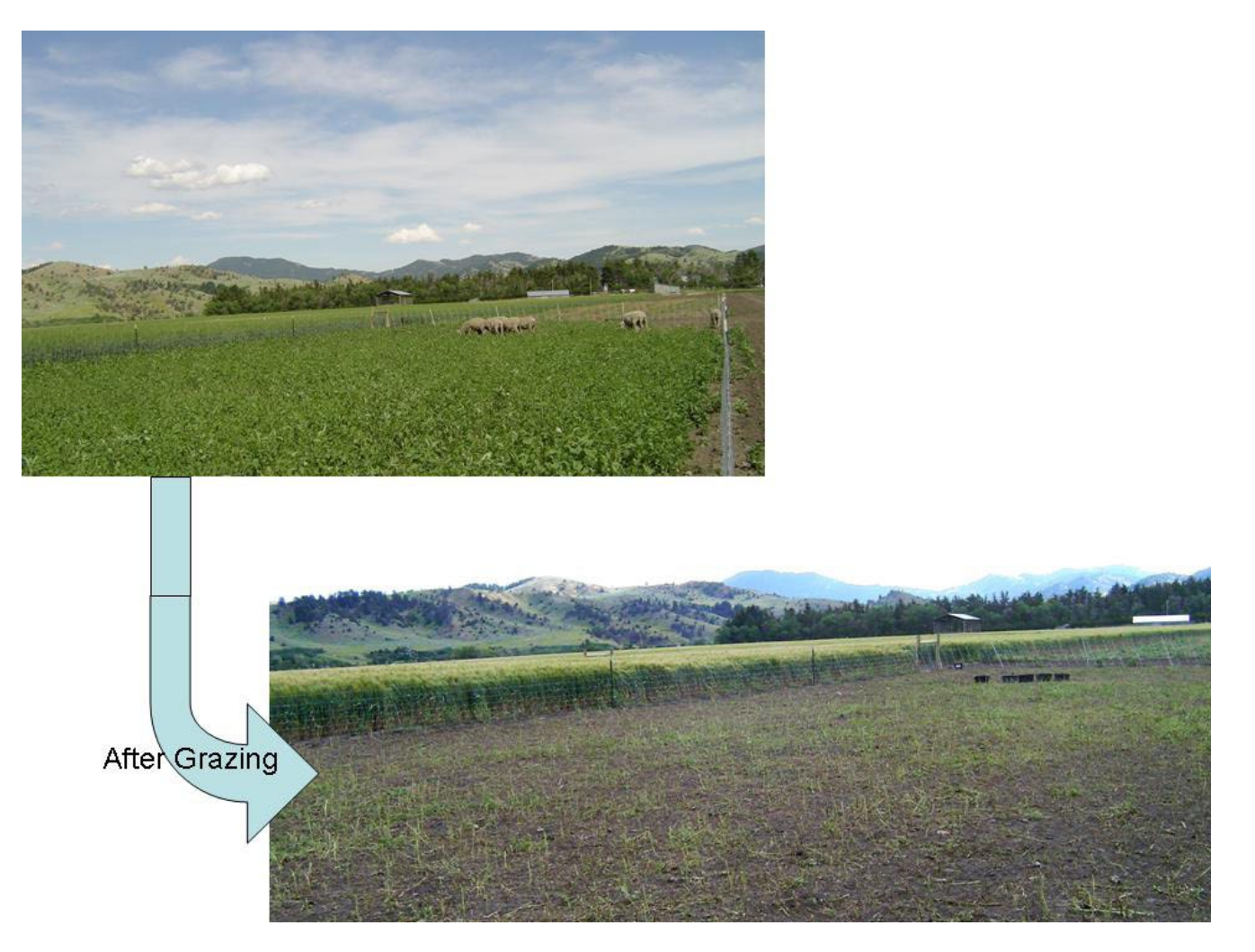
Figure 1. Sheep grazing successfully controlled weeds in a summer fallow field at Montana State University.

Targeted grazing of sheep can be a viable alternative for managing weeds on fallow land since many weeds found in summer fallow rotations (e.g., volunteer grain, kochia, Russian thistle, wild oats, and cheatgrass) are highly palatable to ruminants, particularly when in the young vegetative phase. However, not all weeds are palatable and so it is important to know which weeds are predominant in fields to be grazed. In one study from the 1970s, researchers found that six of 12 species of annual weeds in the young, vegetative growth phase were as palatable as oats to grazing sheep: vellow foxtail, barnvardgrass, green foxtail, redroot pigweed, Pennsylvania smartweed, and common lambsquarters.<sup>2</sup> Four other weed species were unpalatable to sheep and two were identified as "interacters," i.e., some sheep found them palatable, whereas other sheep refused to graze them. Other research at Montana State University has shown that volunteer wheat is also highly palatable for any class of ruminant. Some weeds growing in summer fallow,