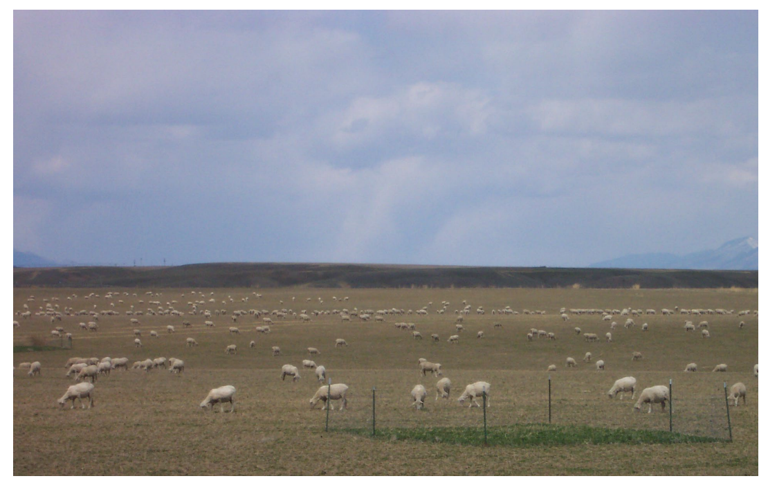
Figure 5. The aftermath of sheep grazing alfalfa in Montana. Grazing reduced harmful insect infestations without impacting hay production.

Grazing Sheep in Summer Fallow. This study, conducted during four years at Montana State University's Fort Ellis Experiment Station, compared the effect of three fallow treatments—sheep grazing, chemical application and mechanical cultivation—on crop production and soil nutrient profiles in a spring or winter wheat/summer fallow two-year rotation. Treatments were imposed during the seedling to vegetative growth stages of the weeds in the field (weeds included volunteer grain and other grass and broadleaf weeds). During the four years of the study, chemical and mechanical treatments were applied 3-4 times per fallow period while the grazing treatment was implemented 4-5 times per fallow period. Chemical fallow plots were treated with Gly Star Plus® (glyphosphate,