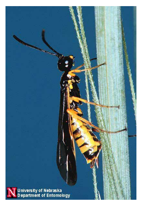
Figure 3. Adult female Wheat Stem sawfly.

Sheep grazing of crop residues offers growers a viable alternative. It is responsive to environmental goals and restrictions and can be adapted to a variety of residue handling practices. For example, sheep can graze either spread or windrowed straw: Windrowing the straw may increase the amount available for consumption by sheep, because less is lost to trampling, whereas spreading provides a more uniform residue cover, which can help prevent erosion along with the grain stubble still rooted in place.