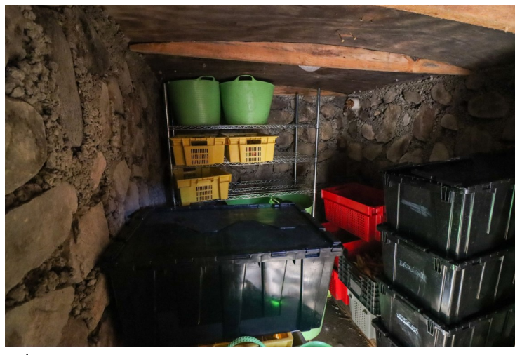
▲ Evan & Heidi's original root cellar

Small Axe Farm operates off the grid and powers their farm off of solar panels so they do their best to limit electricity use. Cold storage is a need on the farm so they make use of root cellars. These passively cooled spaces are the right