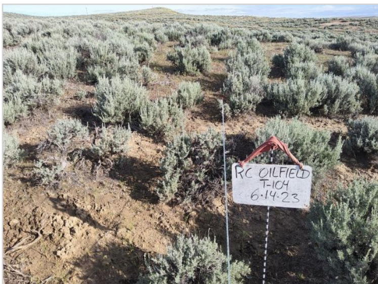
Shortline (Annual / Blink) 2023-06-14