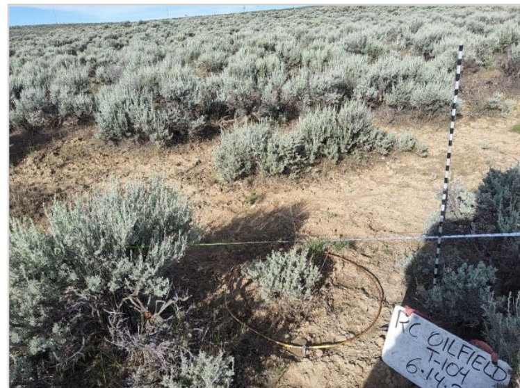
Cvr - Bar:80 Ltr:4 Bsl:3 Mos:11 Rck:2 | SpDv: G:3 F:3 O:2 Hoop 1 Back (Annual / Blink) 2023-06-14