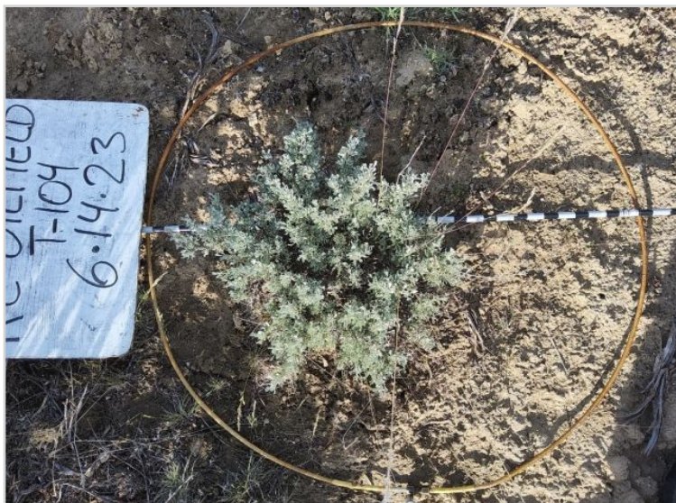
Cvr - Bar:80 Ltr:4 Bsl:3 Mos:11 Rck:2 | SpDv: G:3 F:3 O:2 Hoop 1 (Annual / Blink) 2023-06-14