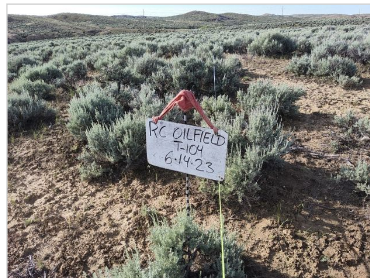
Longline (Annual / Blink) 2023-06-14