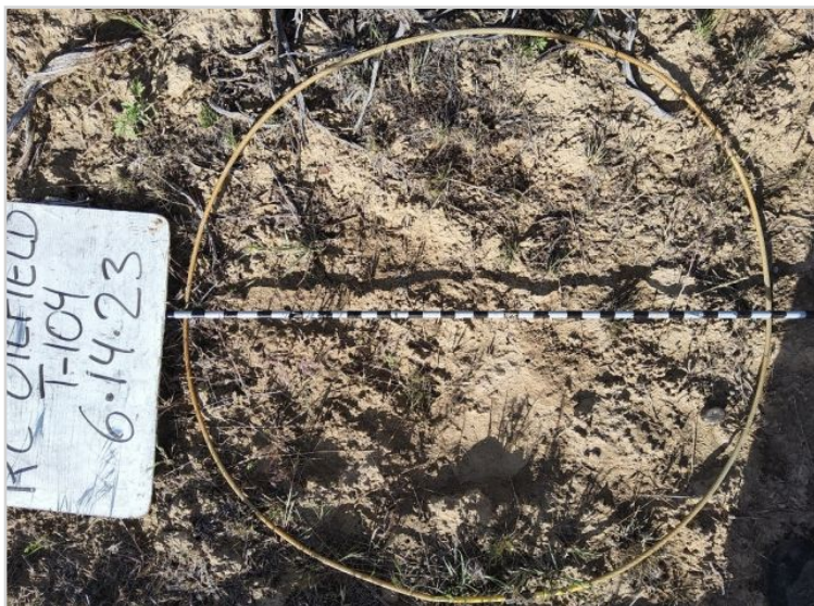
Cvr - Bar:87 Ltr:3 Bsl:3 Mos:6 Rck:1 | SpDv: G:3 F:2 O:1 Hoop 2 (Annual / Blink) 2023-06-14