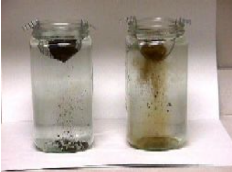
Image: slake test comparing well aggregated soil (left) and poorly aggregated soil (right)