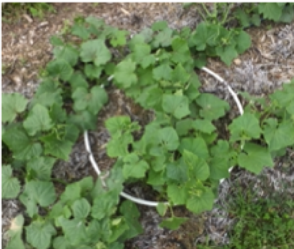
Image: Surface biology observation hoop