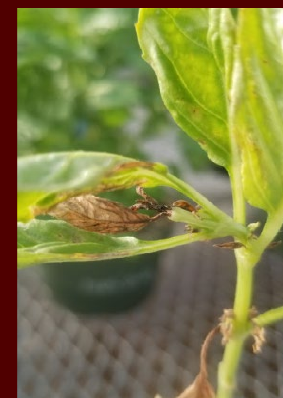
Fig. 4: Tip

death in basil at >25% non-CSCG was very likely the cause of death and may be due to a nutrient deficiency or toxicity.