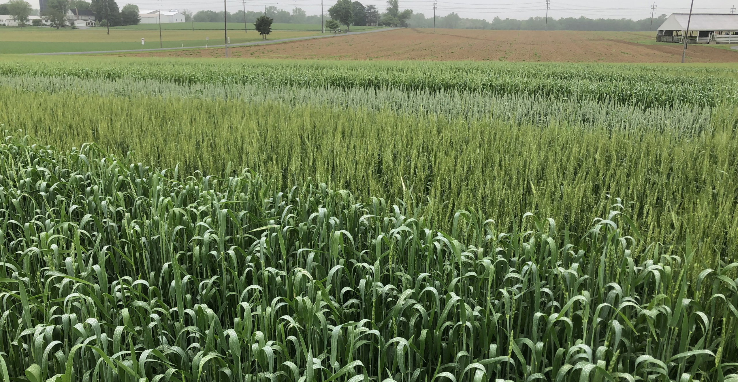
Heading and flowering timing can vary among varieties. May 28, 2018