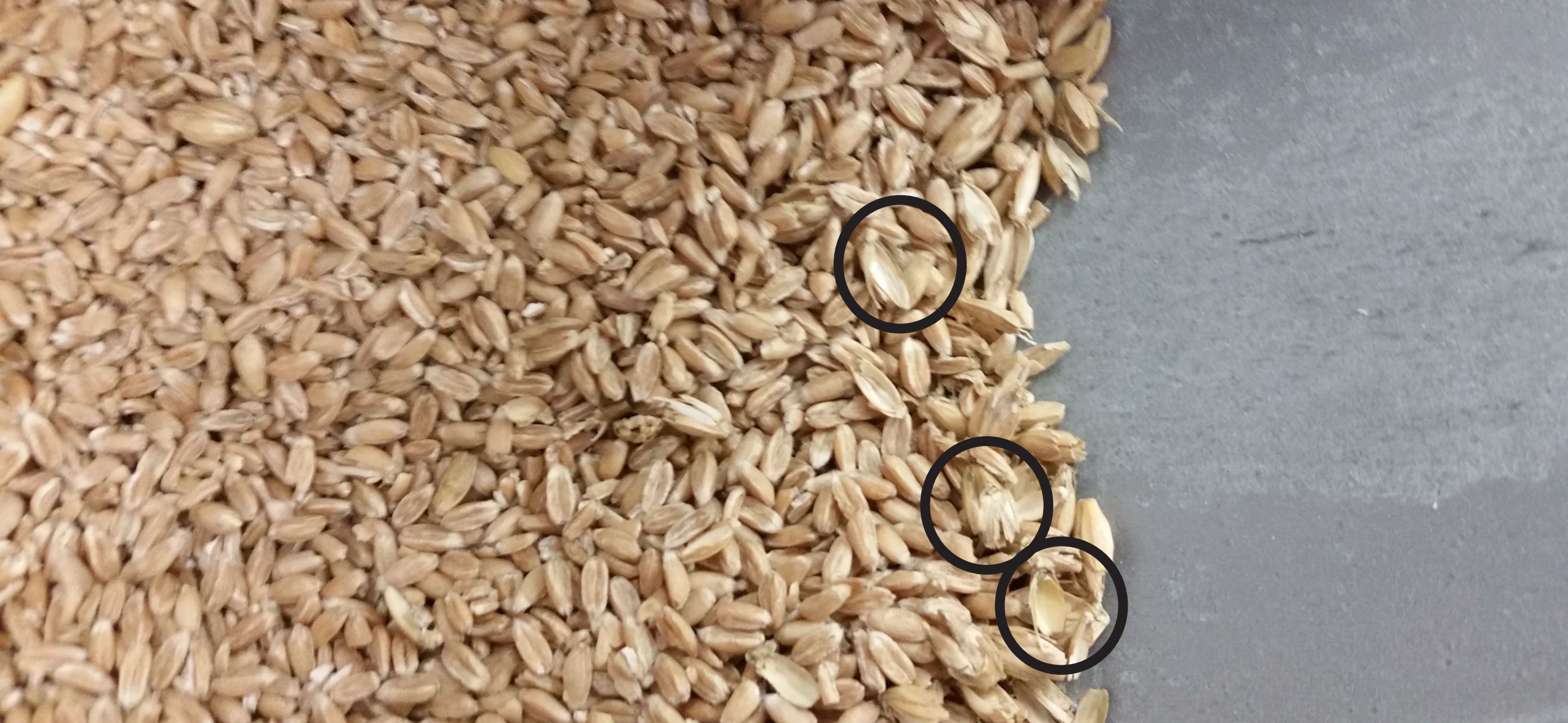
Cleaned spelt grain with a few remaining hulls to the right in the photo.