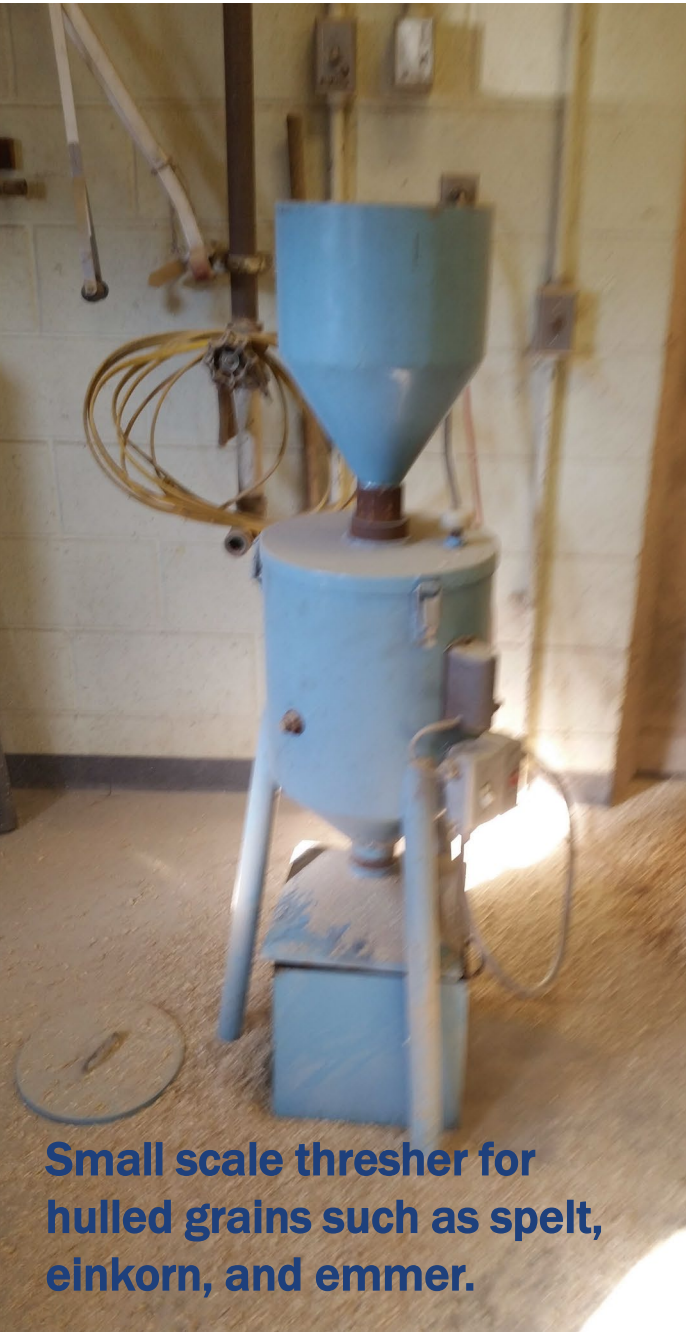
Small scale thresher for hulled grains such as spelt, einkorn, and emmer.