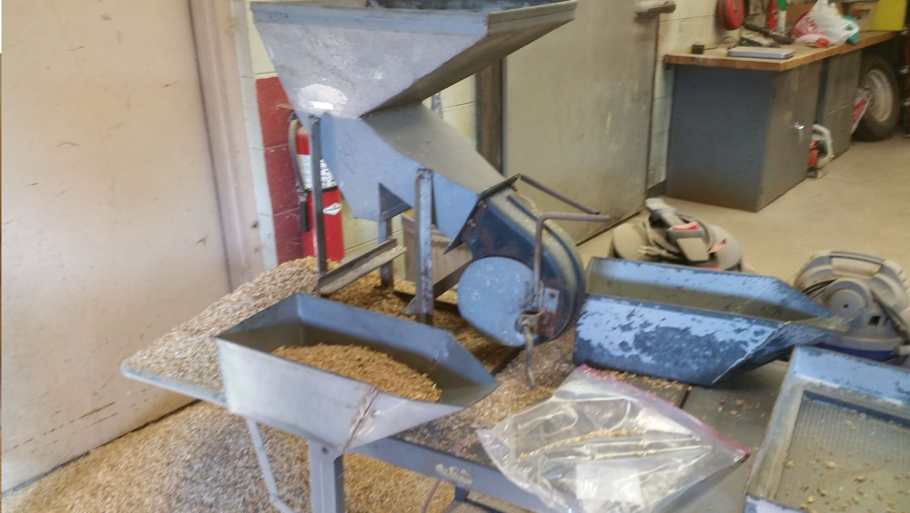
Winnower for separating the threshed hull from the grain.