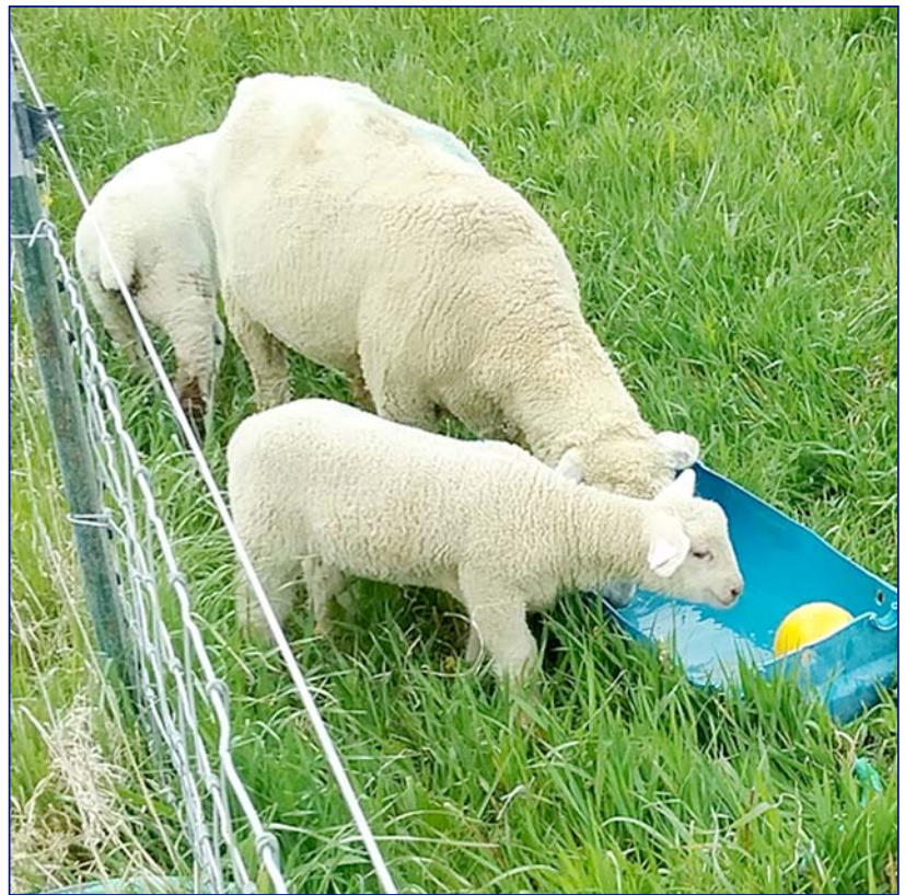
Happy sheep on pasture can be jeopardized by parasites. We can keep them healthy and happy.