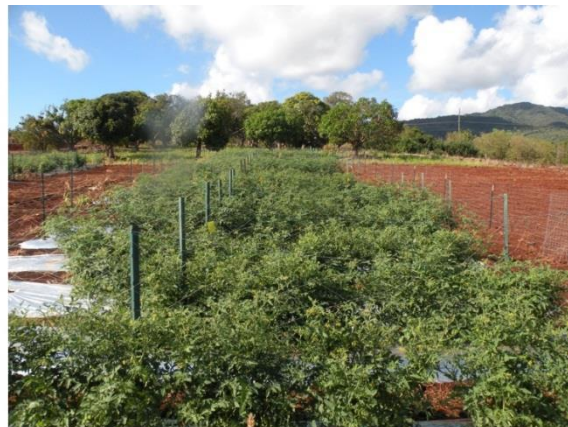
Reflective Plastic Mulch