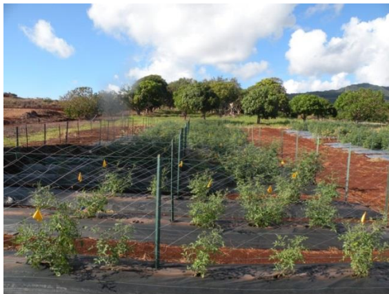
Black Plastic Mulch

Plastic mulches provide many positive advantages for farmers, such as increased yields, early maturing crops, crops of higher quality, enhanced insect management, and weed control. A tomato field trial was carried out at Poamoho Experimental Station from June to October 2015. The main objective of the trial was to assess the effectiveness of a silver reflective plastic mulch to suppress insect vectors of viruses, and other relevant pests in tomato. Two main viruses affect tomato production in Hawaii. Tomato Yellow Leaf Curl (TYLCV) is transmitted by the silverleaf whitefly, Bemisia tabaci , and Tomato Spotted Wilt Virus (TSWV) is transmitted by several species of thrips.