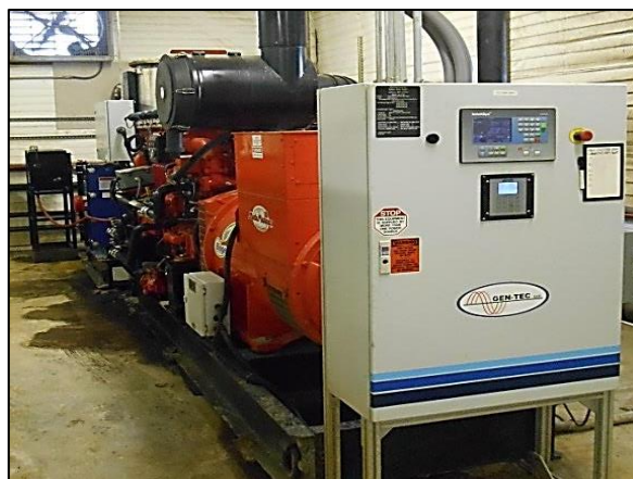
Figure 2. The engine-generator set at Twin Birch Farms.

The biogas goes through an American Biogas Condition, LLC designed H 2 S scrubber and multi-step dewatering process prior to use. The biogas is used to power a Guascor 225 engine generator set (capacity factor of 96%, Figure 2.) and a WL-90 Columbia boiler (1,260,000 Btu per hr). Heat recovered from the engine exhaust and generate by the boiler are used to heat the digester. Electricity is net-metered with NYSEG.