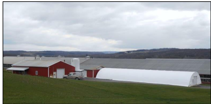
Twin Birch Farm anaerobic digester and biogas utilization building (foreground).