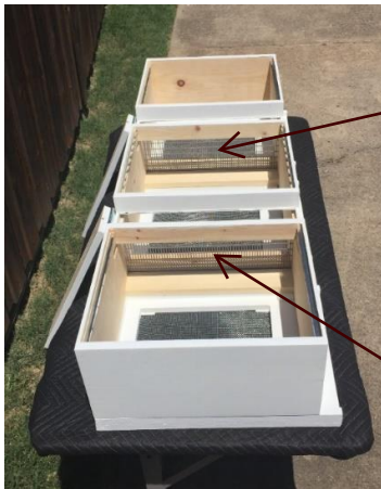
Removable Queen Excluder Divider Panel. A solid Panel may be used when the Hive is first started and over Winter in order to isolate the two Brood Chambers from each other.