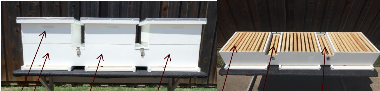
Brood Chamber Honey Chamber Brood Chamber The Two Queen Horizontal Base that Consists of Two Brood Chambers and One Honey Chamber, is Sized to be Compatible with Industry Standard Brood Boxes, Honey Supers & Covers