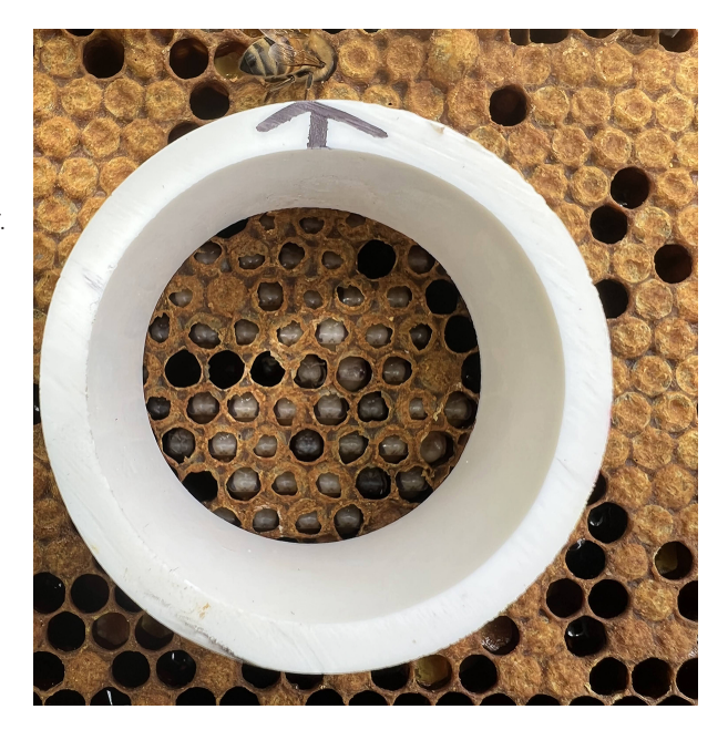
Figure 1. The UBeeO test area after 2 hours. More than 60% of cells are manipulated, making this a high-scoring colony. Worker bees detect the UBeeO scent and uncap the cells to inspect developing brood.

Research suggests that UBeeO-linked traits can be inherited by daughter colonies. However, it is not guaranteed that all daughter colonies will inherit high UBeeO scores from their mother. One factor affecting the likelihood of inheritance is the breeding strategy used to produce queens. Through our preliminary data, the greatest level of inheritance has been achieved by controlling both the matriline (egg source) and the patriline (sperm source) through instrumental insemination.