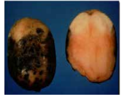
Pink rot causes rubbery, discolored lesions. Internal tissue turns pink after exposure to air.