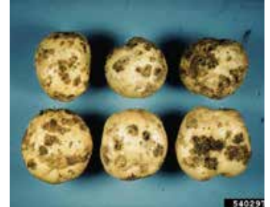
Common scab causes rough, circular spots that can be superficial, raised, or sunken.

Black Scurf and Rhizoctonia Canker ( Rhizoctonia solani ) Black scurf is purely cosmetic and does not reduce yield, even in storage. Irregular, black hard masses on the tuber surface are overwintering structures (sclerotia) of the fungus. Presence of these sclerotia may be minimized by harvesting tubers soon after vine-kill and skin set. While the sclerotia themselves do not cause damage, they allow the pathogen to survive in the soil and serve as evidence of its presence. In cool, wet soils, R. solani can cause dark, sunken lesions on underground sprouts and stolons. These lesions can cut off the supply of nutrients, killing tubers, or can reduce the transfer of starches to the tubers, reducing their