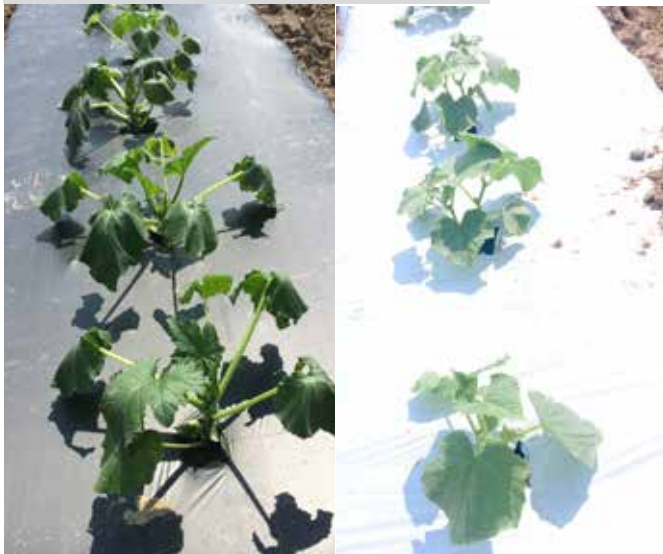
Side-by-side beds: the cucumbers on black plastic (left) are showing signs of heat stress, while those on white plastic (right) are standing tall.

apply protective sprays on susceptible crops for destructive diseases. Especially at risk are tomato and potato for late blight, and cucumbers, butternut squash, and pumpkins for cucurbit downy mildew. Given that late blight is being reported on tomato AND potato this year and conditions will be favorable for disease spread and growth, some growers may want to mow or vine-kill potatoes which are at or near maturity, to avoid the chance of tuber infection. In southeastern MA, a grower reports that it has been a good growing season over all. His fall root crops are looking good except for the germinating carrots which took a beating from the 3 inches of rain they got several weeks ago, washing herbicide down through the soil instead of remaining on the surface. Spring onions are all out and fall storage onions are about 2 weeks from harvest in the southeast. As days begin to get shorter, farm crews shrink in size with students heading back to school, and your attention begins to shift towards fall, we hope you take a moment to pause and marvel at all of the wonderful food you've produced, tricks you've learned, and systems you've improved this year!! We are thinking about fall too, but before the busy season is over we have one more field walk planned next Tuesday at Hurricane Flats in