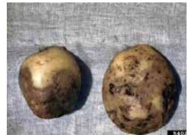
Coppery brown late blight lesions. The disease can spread in storage and affected tubers are very susceptible to soft rot bacteria.