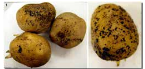
Black scurf symptoms are evidence that R. solani is present in soil.