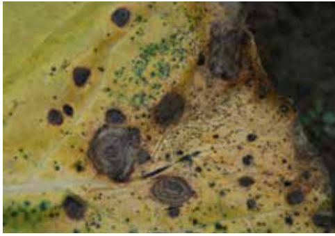
Alternaria on Brussels sprouts leaf

of aphid mummies indicating the activity of beneficial parasitoids. Syrphid fly larvae, predators of aphids, have also been seen in a brassica field in MA. However in fields