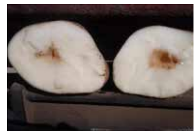
Hollow heart.