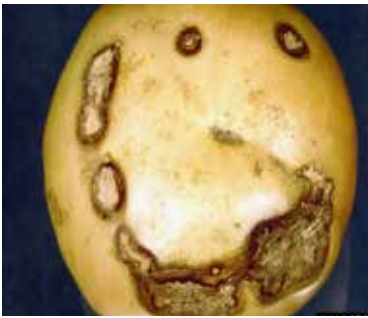
Rhizoctonia solani causes cankers on stems and stolons and sometimes lenticels.

size. Cankers can also form on the tubers themselves, usually at the stolon or in lenticels. Cankers on tubers which can be small and superficial but may be large, sunken and necrotic.