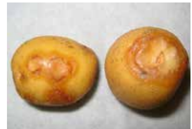
PVY ring spot lesions on Yukon Gold tubers.