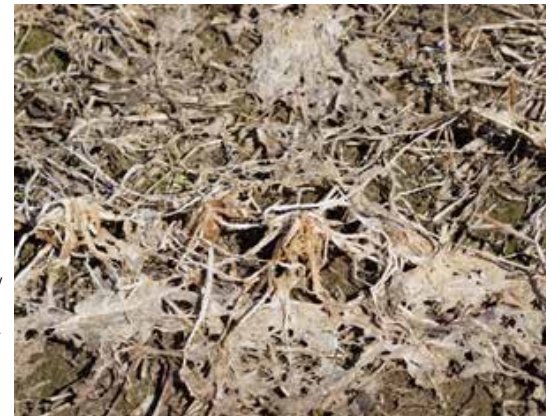
Forage radish residue and weed suppression in mid-April 2015.