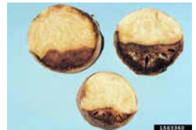
Dry rot causing dark sunken spots on the inside and outside of tubers.