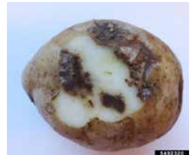
Early blight lesions can spread in storage.