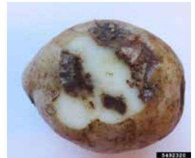
Early blight lesions can spread in storage.