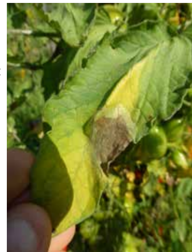
Late blight on Juliet tomato