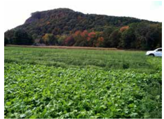
Complete fall weed suppression by forage radish cover crop in October (foreground).