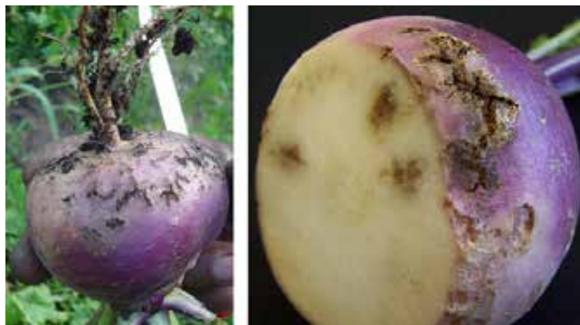
Turnips damaged by root maggots.

Cabbage root maggot (CRM) has four successive generations over the season at this latitude, and has late-season flights that typically peak in mid-August and again in mid-September. Although, some growers this year have reported CRM damage all season long. One grower lost his fall cauliflower planting to root maggot just a few weeks ago, while adjacent broccoli survived. Larval feeding can cause root injury in fall brassicas, especially in the marketed roots of radishes, turnips, daikon and rutabagas. Scarring of the surface and tunneling through the root reduce marketability. The timing of controls is more difficult than in spring crops, because the timing of the flight is more difficult to pinpoint than in the spring, and there are two flights during the growth period of fall crops. Root crops are often planted before the fly is active and roots are subject to larval feeding damage later in crop growth. The organophosphate insecticides (diazinon, chlorpyrifos) that are labeled for use against maggot flies need to be applied before, during or shortly after planting, as pre-plant incorporated applications, as transplant or furrow drenches, or as directed sprays right after planting; fortunately these products have long residual periods in the soil, but there is no option for rescue treatments.