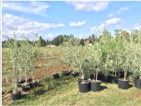
2020 marked our largest plantings yet, as 3 year old/6 gallon pot sized trees were moved from the protective structures, and transplanted in the fall-planted fields at NWREC and Woodhall.