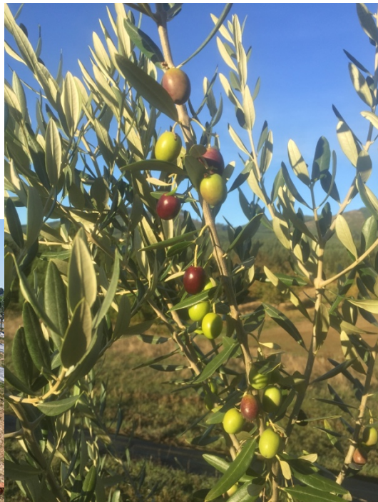
The Olea Olive Research Team won a university award for dedication and continued service throughout the covid-19 pandemic (left); trees at Woodhall produce mature fruit for the first time since the launch of the project (right).