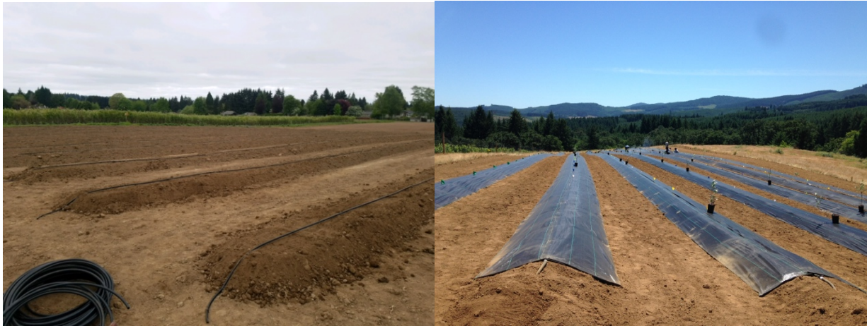
Bedshaping and initial spring planting at NWREC and Woodhall sites, respectively, 2018.