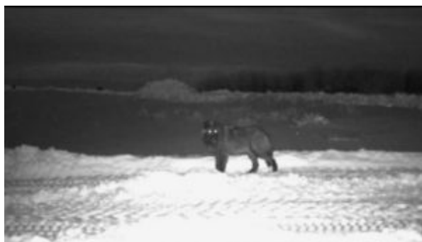
All photos courtesy Don Gittleson.