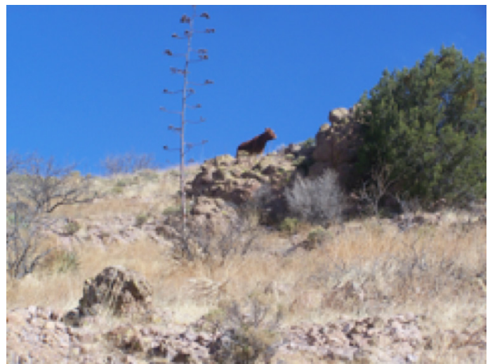
Figure 1. Hill Climbers vs Bottom Dwellers -- Nature, Nurture, or Both?