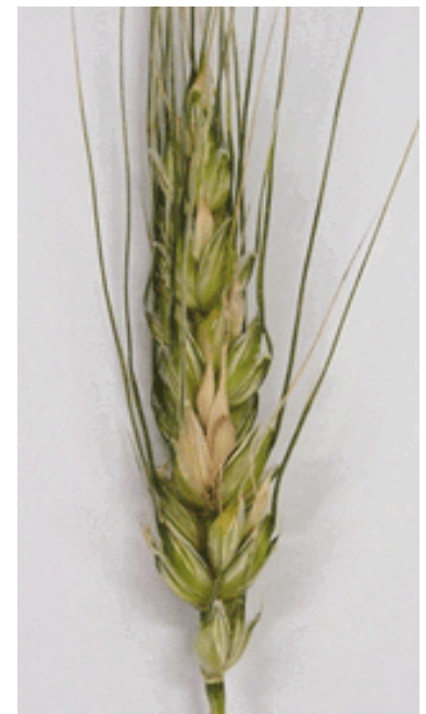
Figure 1. Bleached spikelets within the grain head

Severity of infestation is best determined in the field through two metrics: incidence and intensity. Disease incidence is determined by counting the percentage of heads out of a hundred with any infestation in a random sample taken throughout a field. Intensity is determined by calculating an average percentage of spikelets infected