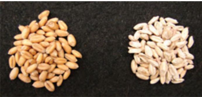
Figure 3. Healthy kernels (left) and shriveled, bleached FHB diseased kernels (right)