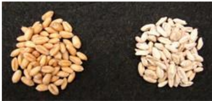
Figure 3. Healthy kernels (left) and shriveled, bleached FHB diseased kernels (right)