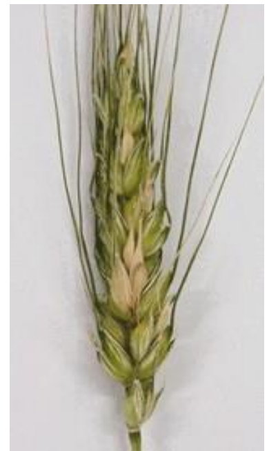
Figure 1. Bleached spikelets within the grain head

Severity of infestation is best determined in the field through two metrics: incidence and intensity. Disease incidence is determined by counting the percentage of heads out of a hundred with any infestation in a random sample taken throughout a field. Intensity is determined by calculating an average percentage of spikelets infected