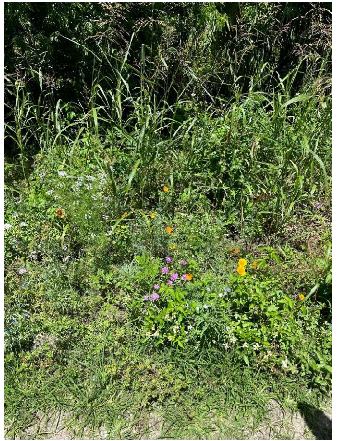
Cover crops are continuously rotated through farm plots that are seasonally planted with cover crops for pollinator forage, agritourism and soil building benefits. They are also routinely moved to make compost.