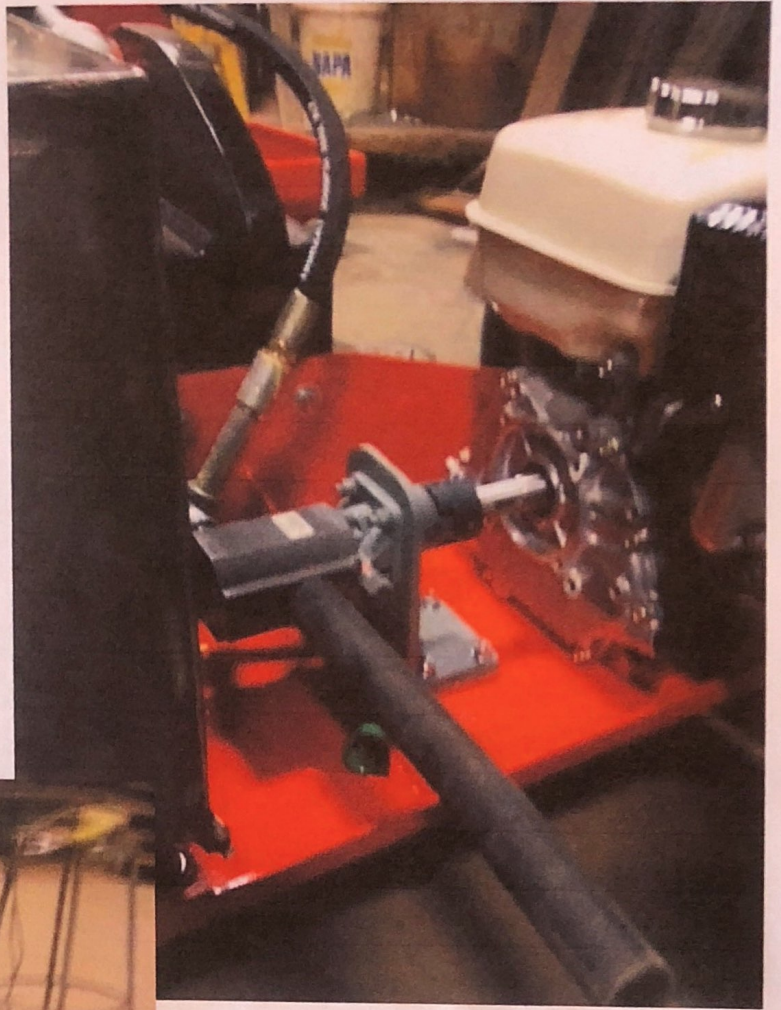
Hydraulic pump engine assembly