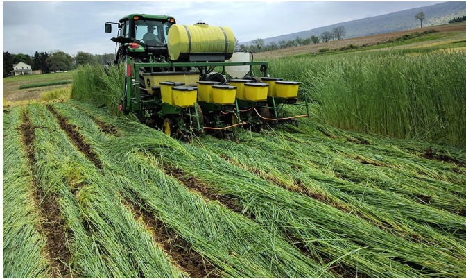
Figure 2. Rolling cereal rye and planting soybeans green in the same pass at Rock Springs