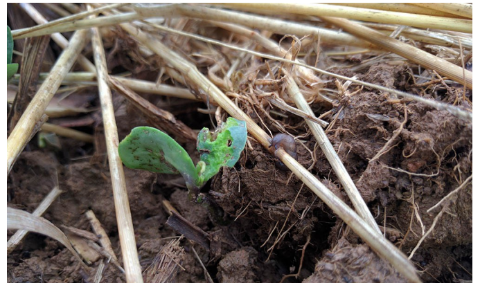
Figure 3. Marsh slug next to a soybean seedling with slug damage at VE in Landisville PA. Planting green may provide alternative forage for slugs and habitat for slug predators.

Multiple farmers have communicated with us that planting green reduced slug damage on their cash crops. Our working hypothesis was that planting green provides good habitat for slug predators, and the living covers provide slugs an attractive alternative, which slugs eat rather than cash crop seeds and seedlings. We found mixed results in our study; depending on year and location, planting green significantly increased, decreased, or had no effect on slug damage on corn at V5. For soybeans, there was a significant reduction in slug damage in two of 14 site years when we planted green compared to preplant-killed cover, but no effect of planting green on soybean damage in the remaining 12 site-years (Figure 3). In two out of 12 corn site-years, armyworm outbreaks reached the economic threshold for both cover crop treatments in corn. Armyworm damage was lower in the planting green treatment at one site, but did not differ between treatments at the other site. So, we cannot conclude that planting green consistently reduces slug damage to corn and soybeans, or armyworm feeding on corn. We can conclude, however, that pest management is more complicated when planting green with fields requiring more scouting to detect possible pest problems.