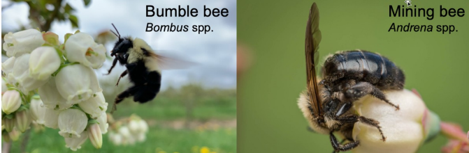
Figure 2. The common wild bees pollinating blueberry crops in central Pennsylvania. Both bumble bee queens (left) and mining bees (right) are active in early spring and are abundant pollinators of blueberries.

Since Pennsylvania lies within the native range of the blueberry, there is a great diversity of native bees that provide pollination services to blueberry farms. Observations performed in three small diversified farms with Bluecrop plantings in central Pennsylvania revealed that the smallest non-commercial planting had the greatest diversity of pollinators. While managed honey bee colonies were present at all sites, they were not commonly observed pollinating blueberries, compared to other wild bees such as bumble bees. For about every honey bee visiting blueberry flowers, we observed about 3 bumblebee queens (Figure 2). Mining bees in the genus Andrena were also a major group of wild bees observed at all sites (Figure 2). Both bumble bee queens and mining bees are active in the spring when blueberry flowers begin to bloom. At least 11 different species of Andrena have been observed pollinating blueberries in central Pennsylvania, often clinging to flowers during their visits.