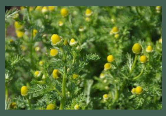
Pineapple weed: Lower growing, Solid flower head Perennial. Locally along roads