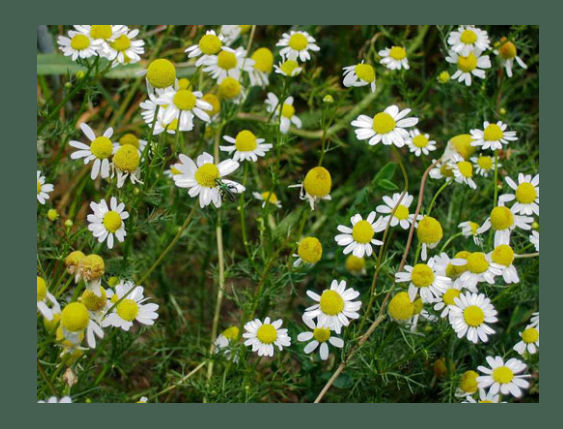
German: Grows 2-3 ft tall, annual Flower head hollow