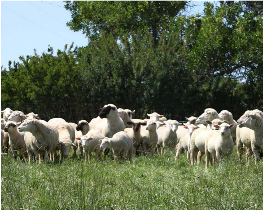
Ready to move. Six to eight inches of residual.